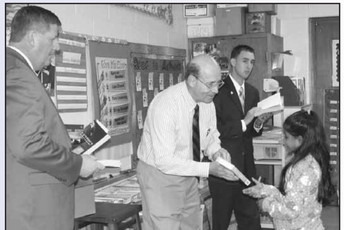
Gazeteers were hand-delivered to each student in all three schools.

The Rotary initiated this endeavor in 2007, and last year NEFCU stepped in to provide funding for the gazeteers. The partnership was successful and the two groups decided to once again work together to lend a hand in the community. The gazeteers, in addition to being comprehensive dictionaries, feature biographies of U.S. Presidents, facts about the planets in the solar system, maps of the seven continents, weights and measures, information on the 50 states, the Declaration of Independence, the Constitution, and much more.