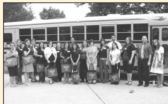
Prior to the start of the school year, new teachers in Bethpage were provided with an orientation of the District, which included a bus tour. Additionally, all faculty participated in two Superintendent's Conferences, one the day before school started, another on Election Day.

Bethpage staff members have attended two Superintendent's Conference Days since the onset of the 2009-10 school year. The first was held the day before classes began, and included a welcoming, recap of last year's highlights, and an afternoon workshop.