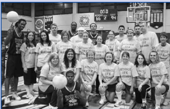
Bethpage JFK Blizzards with Harlem MagicMasters basketball players.

Students at JFK Middle School are now pros when it comes to good sportsmanship, working hard in school, and staying on the right track, thanks to guidance from the Harlem MagicMasters basketball team. The team tours throughout the world, combining the enjoyment of athletics with youth mentorship.