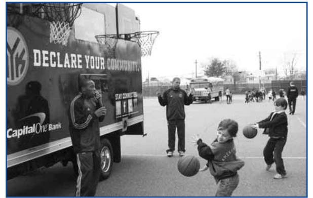
Students enjoyed the "Groove Truck" set up by the New York Knicks.

The High School Cheerleaders and Golden Girls Kickline Team inspired a round of applause for reading, with the Golden Eagle mascot offering plenty of high-fives. The third graders enjoyed watching their teachers shoot hoops, and had the opportunity to do so themselves with assistance from the student athletes. As a special highlight, students visited the New York Knicks "Groove Truck" outside, where they took basketball shots and were presented with free gifts.