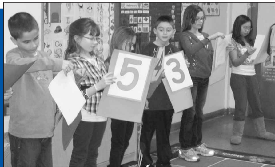
Kramer Lane students put on a skit based on the book "One" by Kathryn Otoshi.

The assembly concluded with a "walk of unity" around the school grounds. "It was just an amazing sight to see 850 students, faculty, and staff