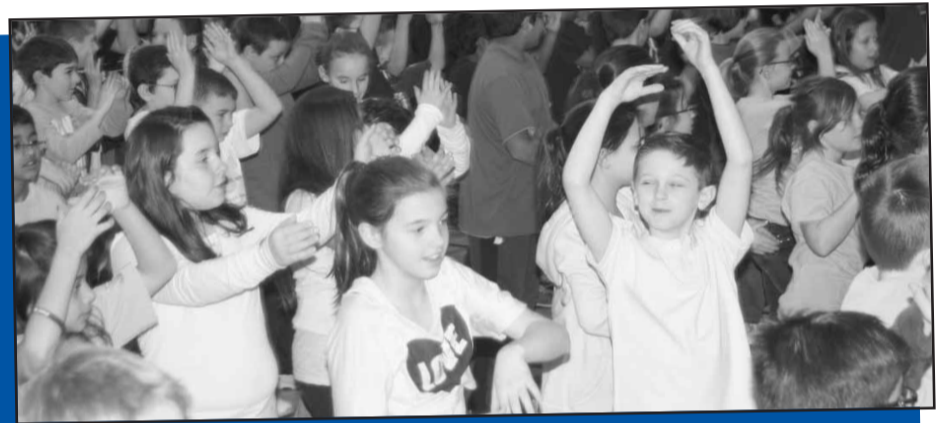
Charles Campagne School's flash mob danced to Bruno Mars' "You're Amazing Just the Way You Are."