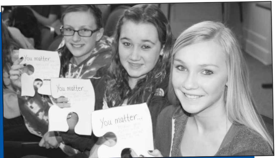
JFK students wrote messages describing why "I, You, and We Matter..." on puzzle pieces.