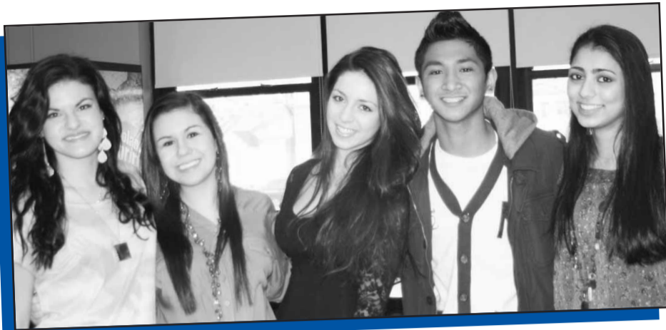
Bethpage High School students got together before speaking to JFK students about different forms of bullying and what it means to be a bystander.