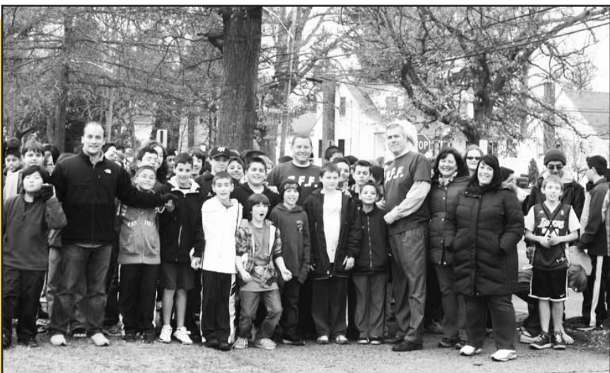
JFK students and staff participated in a "unity march" around the school grounds.