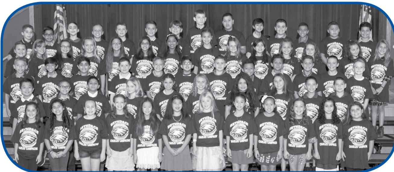
CCS Grade 5