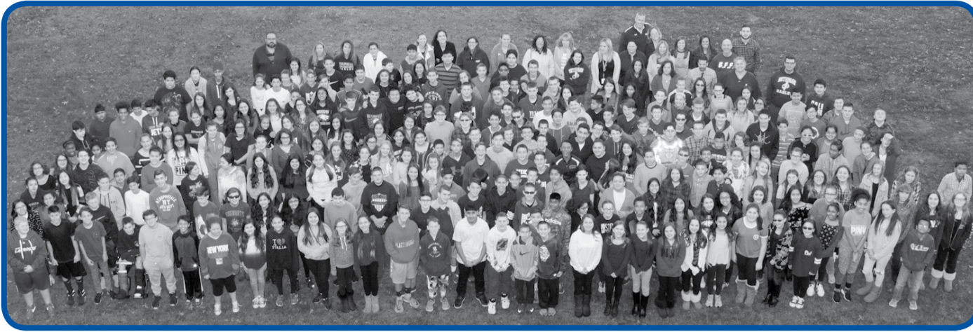
JFK MS Grade 8