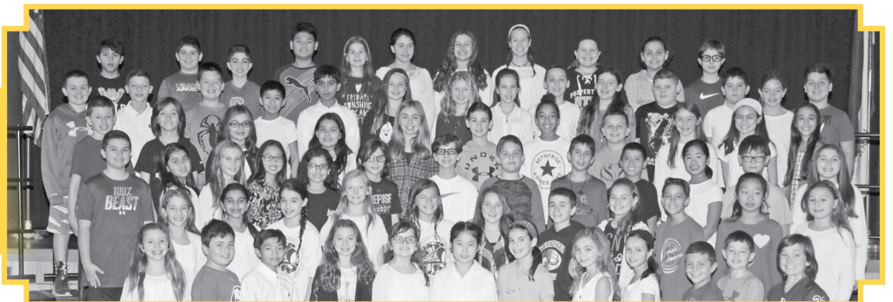
KLS Grade 5