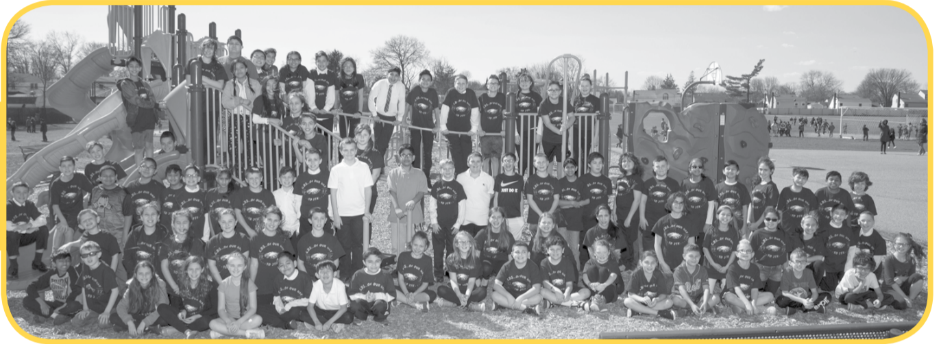
CBS Grade 5