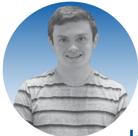
Nassau County Legislative Award: