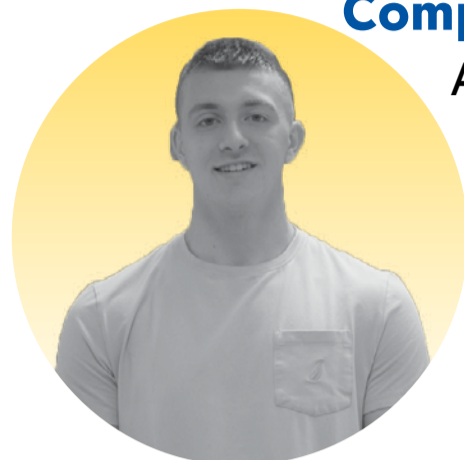
Nassau County Comptroller Award: