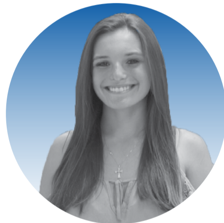
NYS Comptroller Award: