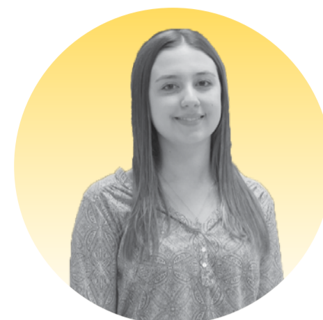
Nassau County Legislative Citizenship Award: