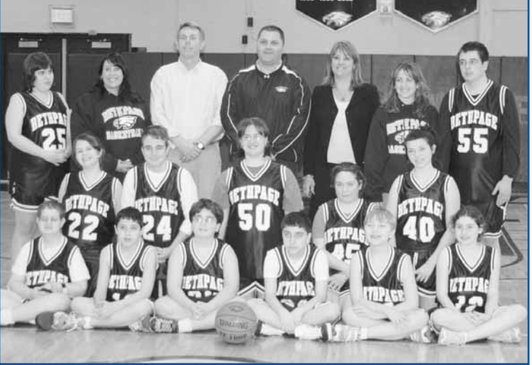
The Golden Eagles take time for a team photo before their first game against the Calhoun Colts.