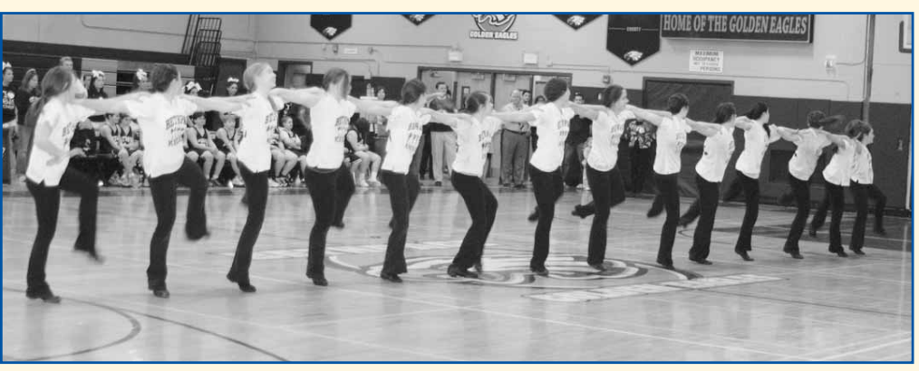
The Golden Girls kickline team performs before the game.