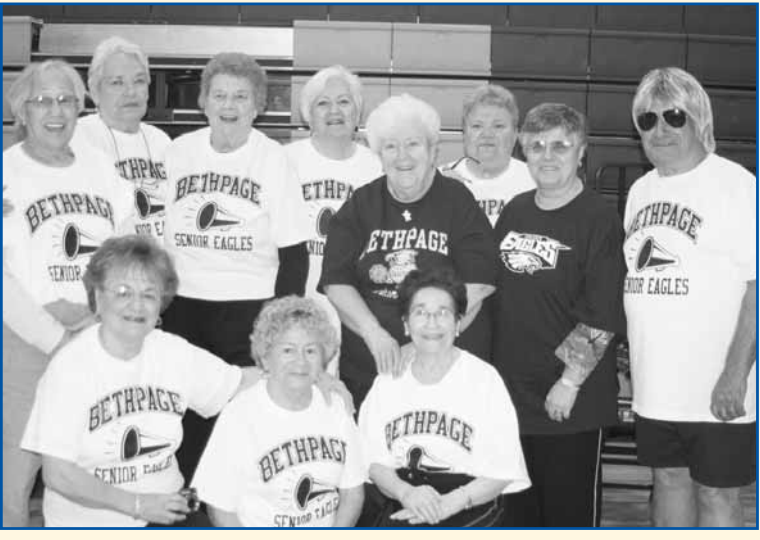
The Senior Eagles were present to support the new team, and performed at halftime.