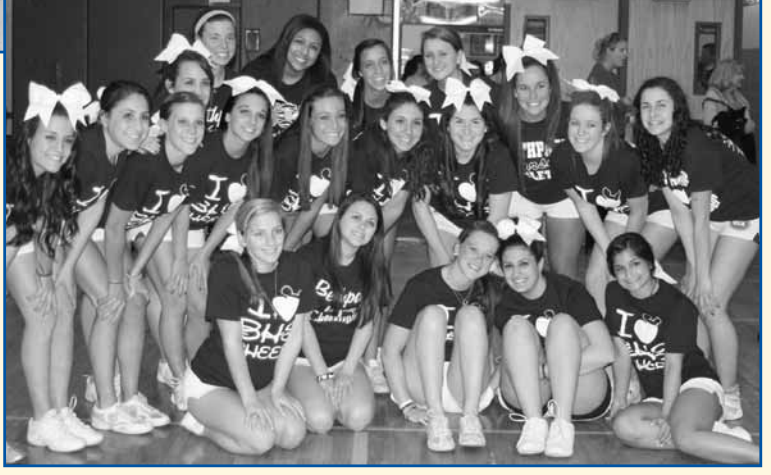
The Bethpage High School Varsity Cheerleaders pose for a group photo.