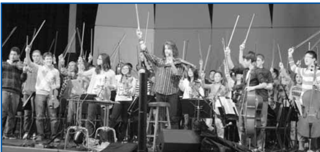
Applause for a great performance.