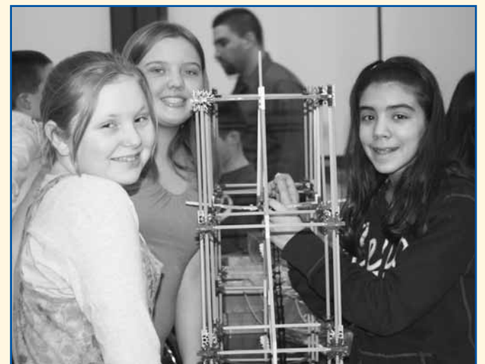
JFK Middle School sixth graders construct rescue systems using K'NEX.

The K'NEXpert Classroom Challenge encourages students to use science, math, and technology skills and to apply an organized and logical strategy as they create and problem-solve in the building of a rescue system. The challenge also increases the students' manipulative skills and sense of cooperation with team members.