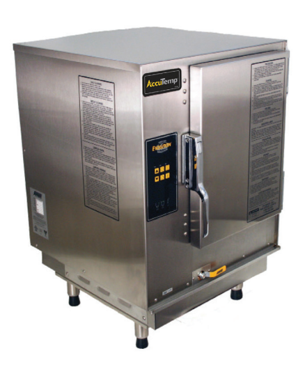
N6 Evolution™ Model shown with optional bullet feet

Evolution™ steamer is AccuTemp Products' connected, boilerless steam cooker that utilizes AccuTemp's Patent Pending Steam Vector Technology for faster cook times, improved energy efficiency, better pan to pan uniformity, and less water consumption. Steam Vector Technology requires no moving parts inside the cooking chamber. Steam to be produced inside the cooking cavity with no heating components exposed to water. Unit to be powered by a Heavy Duty Stainless Steel Blue Flame Power burner, Easily connects to water, drain & gas lines. Uses less than 1 gallon of water per hour. Unit to include low water, high water, overtemp warning lights and auto shut off feature. Evolution™ to include heavy duty, field reversible door. Standard digital controls with independent timer. No water quality exclusions to warranty and no water filtration or treatment required. Unit to be UL Safety and Sanitation Certified, and Energy Star qualified. Built in USA.