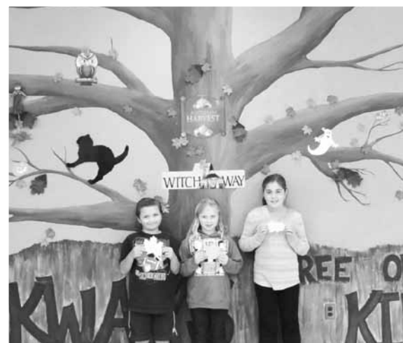
Parkway students prepare to hang their leaves on the Tree of Kindness as a reward for displaying positive behavior.

At Parkway Elementary School, students are being awarded for their acts of kindness and respect toward their teachers and peers. This school has formed a Tree of Kindness in the school's cafeteria. Any student "caught" doing something positive is rewarded with a leaf, which they are then invited to hang on the tree. The beautifully painted tree is adorned with seasonal decorations, but the goal remains the same: at the end of the year, the tree's branches will be densely covered with leaves that resulted from kind acts toward one another.