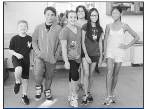
W.T. Clarke Middle School students "stomp out bullying" during the month of October.

During the month of October, the students participated in a variety of activities, which included the signing of a banner and character education assemblies. The month commenced with the signing of an anti-bullying pledge and a schoolwide stomping of feet during the advisory period to symbolize the riddance of bullying.