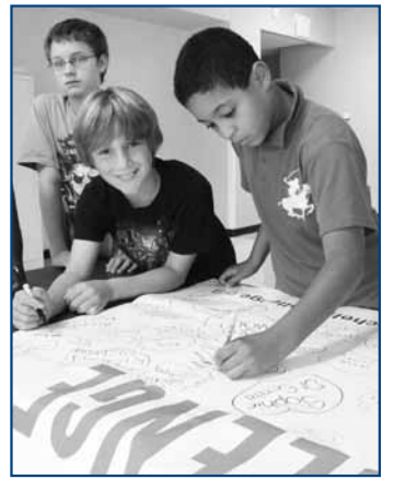
By signing the Rachel's Challenge banner, Woodland students pledge to start a "chain reaction of kindness to others."

The assembly followed with a number of related activities in the classroom and the signing of a banner in the cafeteria.