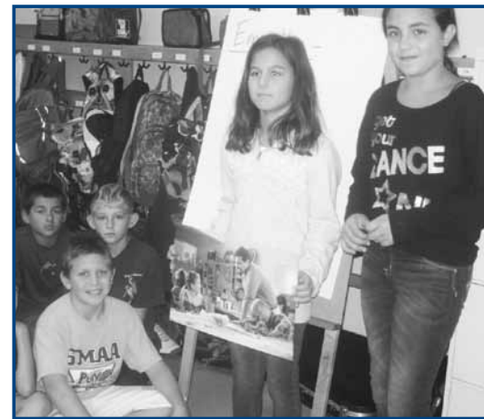
Meadowbrook students participate in a Second Step program at the beginning of the school year.

Meadowbrook Elementary School has implemented the Second Step Program, a curriculum which teaches students skills central to social and emotional development including empathy, problem solving and anger/emotion management. Students engage in role play, songs, group discussion and other activities based on a picture. The guiding theory behind the Second Step exercises is to teach students to identify emotions, to recognize the causes of emotions, to respond thoughtfully rather than impulsively and to manage intense feelings.