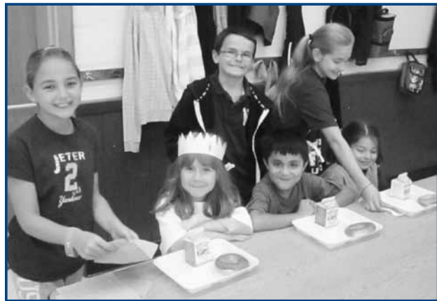
Goodwill Ambassadors provide a helping hand to younger students during lunch.

Bowling Green's Goodwill Ambassadors, chosen by teachers for their compassion and kindness towards others, have been working diligently to assist students in fostering friendships. During recess, the ambassadors reach out to their peers and utilize skills to kindle on-campus friendships and social contacts after school. The positive feelings engendered by these contacts help to create an overall atmosphere of friendliness within the school. The fourth-grade ambassadors also assist with kindergarten and first-grade students during lunchtime.