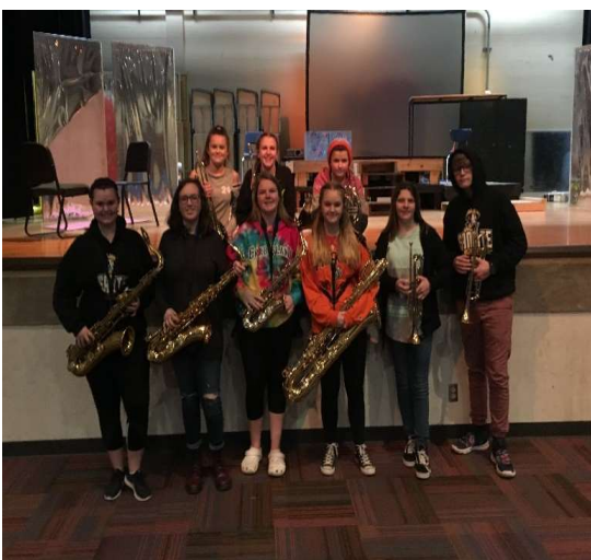
8 th Grade Band Students – Clyde Boyd Middle School