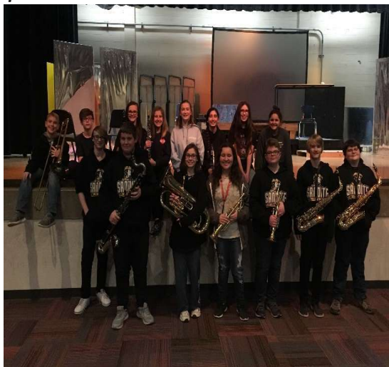
7 th Grade Band Students – Clyde Boyd Middle School

*CBMS 7th & 8th grade band students competed in the OSSAA Middle School Solo and Ensemble Contest. They did an amazing job! We had 29 students who earned Superior Ratings (the highest rating possible) and 3 who earned Excellent Ratings (the second highest rating.) Great Job CBMS Band! We are so proud!