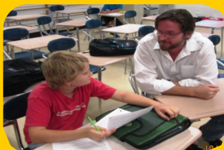
Supporting students in study hall!

The Y Horizon Program is committed to helping the kids in our program excel academically. If any of your students who are in our program are missing assignments or homework , please let us know and we will make it our priority to follow up with students. Communicate with the Program Manager to find out how we can get homework assignments daily for students to work on during study hall. Also, we are happy to attend any team meetings, staff meetings or other gatherings that parents, teachers and/or admin deem beneficial. Just let us know!