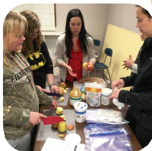
Just making some Apple Pie with the Y Nutrition Team!