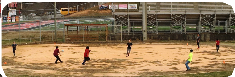
There is always time for a riveting game of kickball during Wellness!