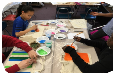
Painting and Expressing Yo Self!