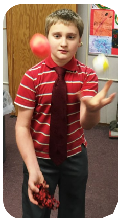
Juggling around in LEAF Circus!