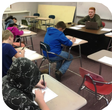
Preparing for the Zombie Apocalypse. Be Ready!

YMCA of WESTERN NORTH CAROLINA Y Horizon Program Community Development 201 Beaverdam Rd. Asheville NC 28804 828 210 2263 www.ymcawnc.org