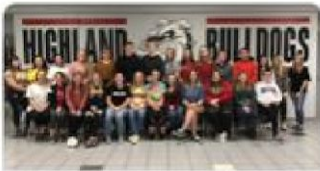
Highland High School announces Illinois State Scholars

Highland IL high school announces Illinois State Scholars | Belleville News- Democrat