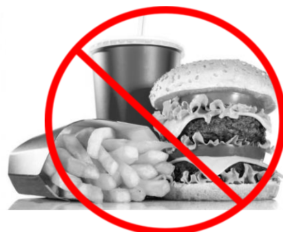
Outside Food/ Drinks*