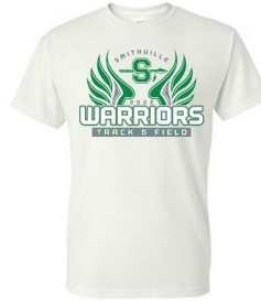
Gildan Dryblend® T-Shirt