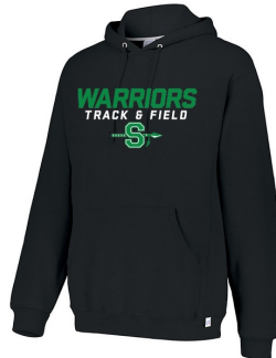
Russell Athletic Dri-Power® Fleece Hoodie