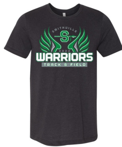
Bella + Canvas Unisex Triblend Short Sleeve Tee