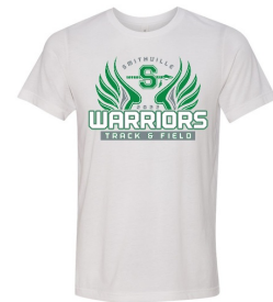
Bella + Canvas Unisex Triblend Short Sleeve Tee