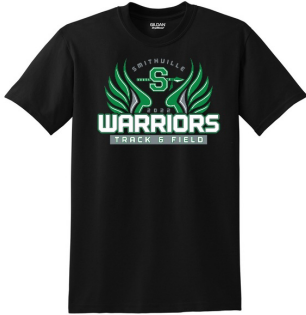
Gildan Dryblend® T-Shirt