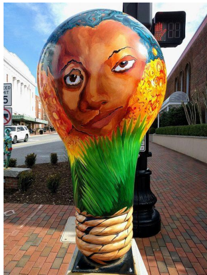
One of the bulbs that can be found in Spartanburg