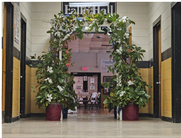
This is the entrance into the elegant ballroom the day of the boys' club dance

BHS Color Guard has had an amazing season, both this past fall and this winter/spring season. Every performance is one in which they give their all and bring it to the stage to win! We are so proud of all of their accomplishments. Their most recent award places them as the SC State Champions in SAAA! We here at Blacksburg High are thankful for an amazing show, a fabulous director, and awesome student performers. Blacksburg High School is beyond proud that these young women and their leaders are who represent our school!