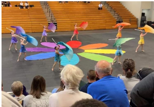
The Color Guard performing at the state competition