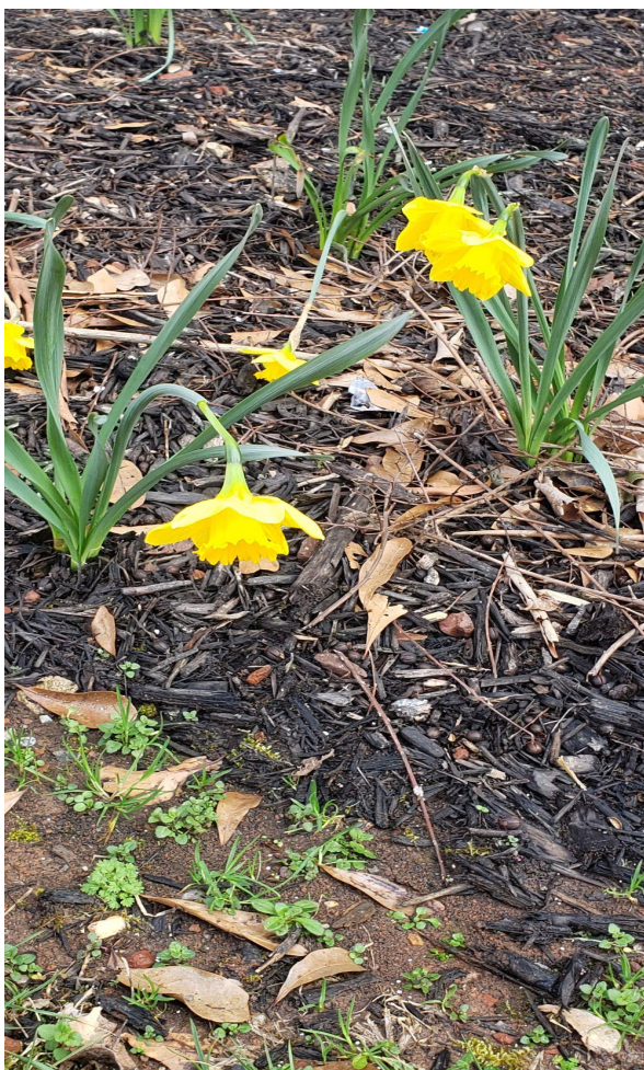
The flowers the boys club planted are located in the front of the school building.