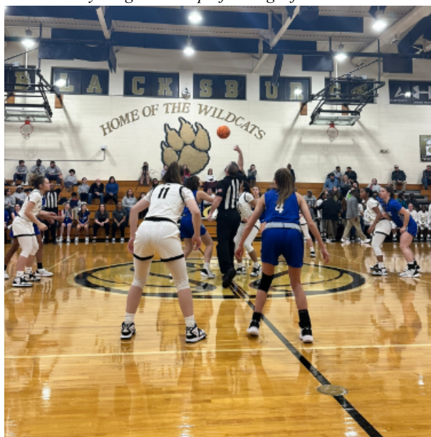
Varsity Girls tip off against Greenville tech

The triple header was a great success for our Wildcats, as it gave us wins that we all needed.