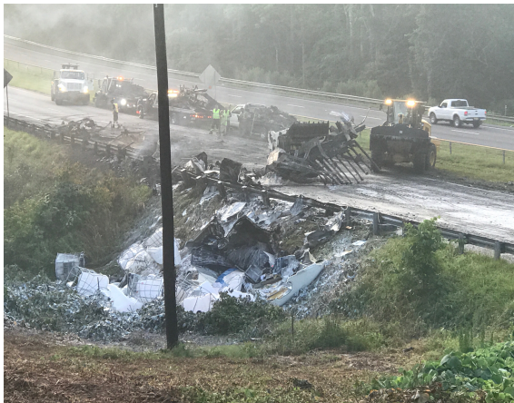
Photo of 18-Wheeler which resulted in the driver obtaining minor injuries in the I-85 crash near Blacksburg, South Carolina.

On January 4 th , at approximately 7:21 am, a Trans 7 Transport company truck traveling south on I-85 went over a guardrail and hit the wall of a low bridge between mile markers 95 and 96. This caused the truck to fall off the bridge onto its side. Once the first responders arrived, the driver was able to climb out of the cab with only minor injuries. It was raining extremely hard, with heavily reduced visibility at the time of the accident. The motor of the semi was lying in the right lane, causing it to be shut down well into the day. The right lane being closed caused traffic to slow down a significant amount; therefore, this caused many drivers to find alternate routes. Highway 29, being the main detour to get around the site of the accident, was bumper-to-bumper which caused traffic in town to be backed up for miles. The blocked route was also the main route I2 buses and car drivers take to get there and back to school. As a result, many students had to take alternative routes which caused them to be late for classes.