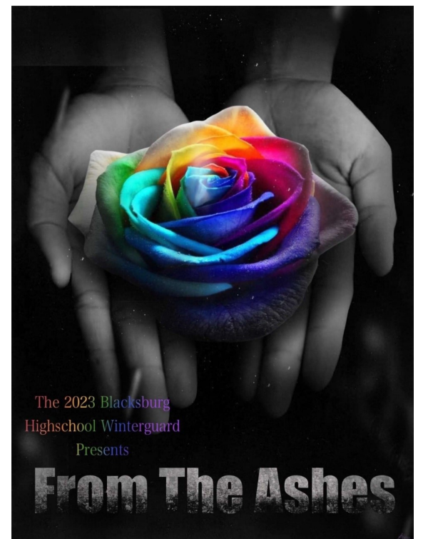
Theme for this year's Winter Guard Season