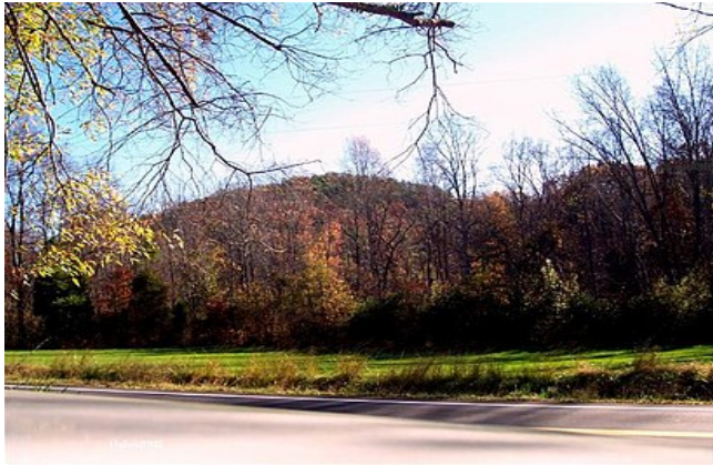
Fall color arrives in the SC mountains.