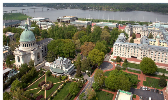
United States Naval Academy in Annapolis, Maryland.

Often fall is spent doing activities that people can't do during the heat of the summer or the cold of the winter. Traditions and activities like these are what make fall special.