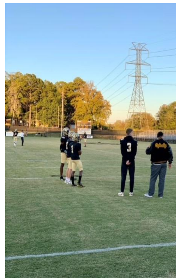
Blacksburg Wildcats Varsity players prepare to fight their Homecoming battle against Chesnee Eagles.

The next week on October 14, 2022, BHS played its Homecoming game against Chesnee. The game was a very close game. The Wildcats played a good game, scoring several touchdowns; however, they ended up being shy by just two points with the final score being 25 - 23, favor of Chesnee.