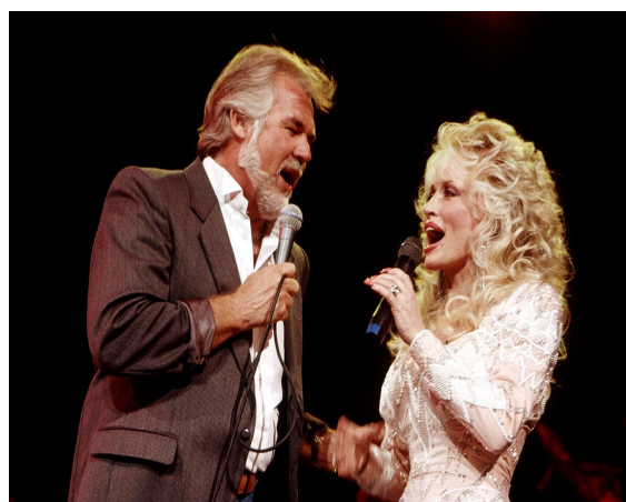
Kenny Rogers and Dolly Parton collaborating on their single “Islands in the Stream.”

“Islands in the Stream” by Kenny Rogers and Dolly Parton