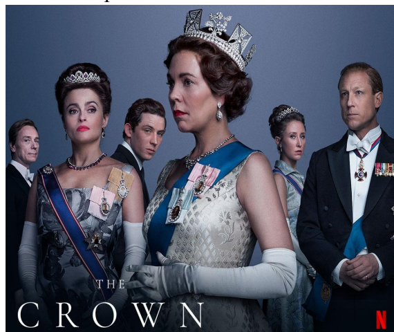
NetFlix award winning series the crown details the life of Elizabeth II through her 70 year reign.

The Crown dramatizes the story of Queen Elizabeth II's political and personal life. The show is rated TV-MA, and it has four seasons. Although the fifth season was reportedly going to be pushed back due to the recent passing of the Queen, Netflix released a statement saying it would be released as planned.