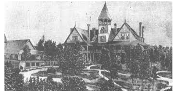
The Cherokee Inn around 1900. One of several resorts located in the Blacksburg area during the early 1900s.