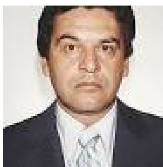
Enrique (KiKi) Camarena, former DEA Agent who was brutally tortured and murdered.

Blacksburg High School will participate in Red Ribbon Week beginning October 23, 2022. More information will come about the activities planned for that week.