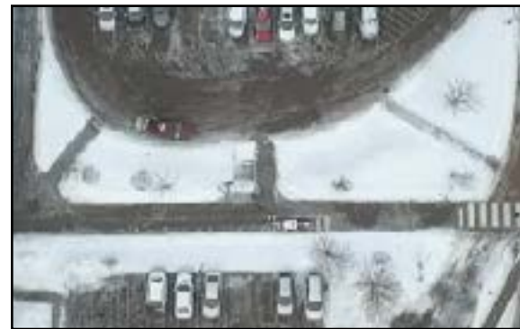
Aerial view of the exposed walkway.