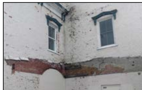
Exterior view of 1889 Hospital Building.