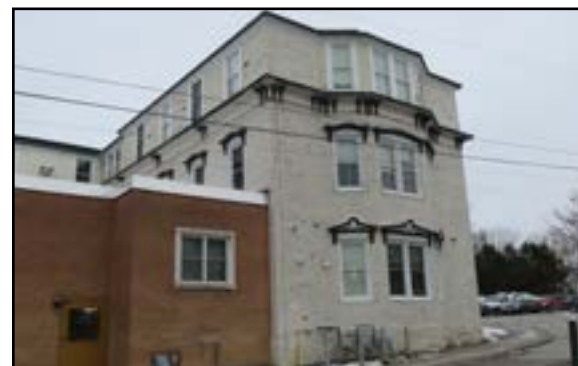
Exterior view of 1889 Hospital Building.