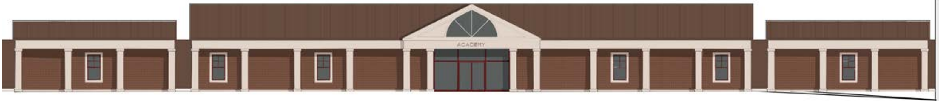
A rendering of the proposed connector between buildings at Bellows Free Academy.