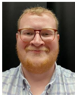
Mr. Border Band 6-8