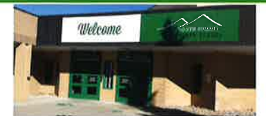
Current elementary=Pre K-2