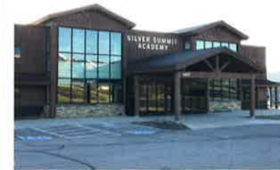
Silver Summit Academy building #1