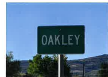
NEW elementary in Oakley

*Funded using existing capital improvement funds