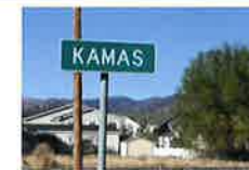
NEW high = 9-12