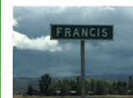
NEW elementary in Francis