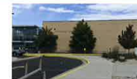
Current middle = 3-5