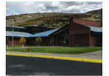
Current high = 6-8