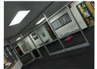
Security improvement projects*