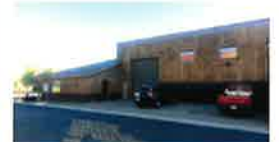
Remodel middle school in Silver Summit