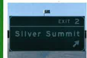
NEW elementary in Silver Summit