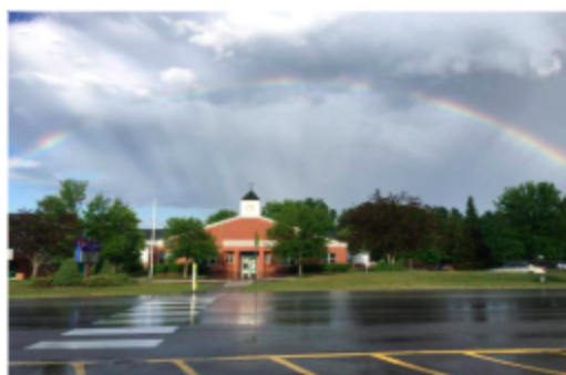
Helen Thompson Elementary School