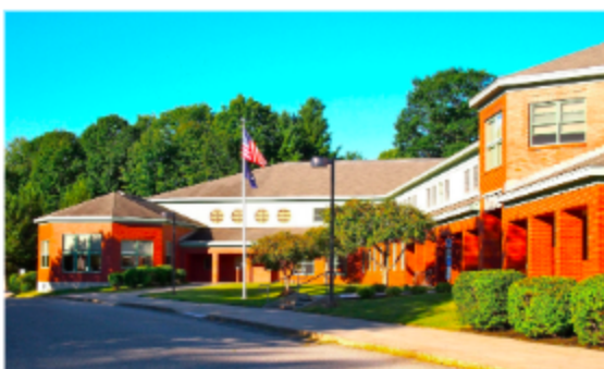
River View Community School