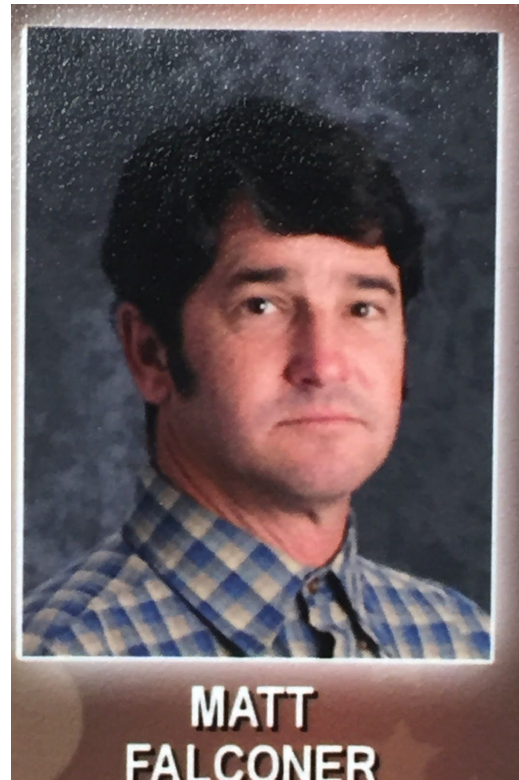
Vote for Pedro