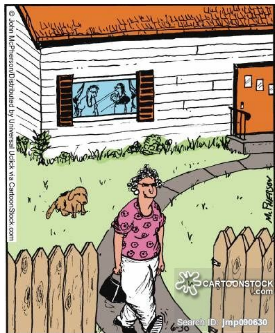
"That'll teach your mom to stop giving us obnoxious parenting advice. I slipped the dog's electric Invisible Fence collar into her back pocket."