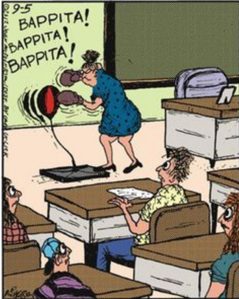
Veteran substitute teacher Vera Nagle found that warming up a bit with her boxing bag helped to keep classrooms under control.

We are looking for substitutes for our aides and kitchen staff. Come work at our school, nestled in the beautiful hills of Edgewood. Good hours, fresh air, happy students and staff makes this an exciting place to work. If interested, please stop by the front office to pick up an application.