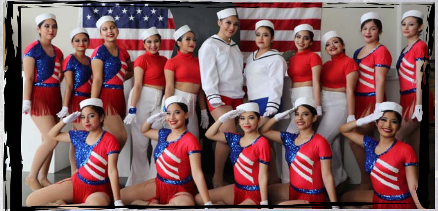
Trevino Magnet School students and faculty salute members of the Armed Forces with dance and music performances.