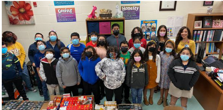
Santa Maria Elementary School and the National Elementary Honor Society students collected food items for the Bethany House.