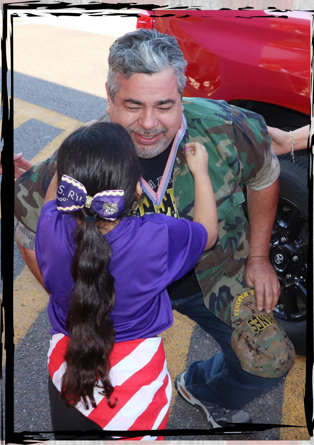
Ryan Elementary School students honored their relatives who are veterans with a medal and certificate during a Veterans Day Drive Thru Parade at the school this morning.