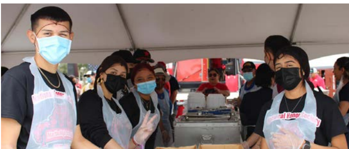
MHS National Honor Society Students partnered with the Texas Food Bank and HEB to help in the Feast of Sharing! Tigers always helping our community!

Santo Nino Elementary School National Elementary Honor Society members and staff distributed Turkey Baskets donated by Project Faith to families in the Santo Nino area.