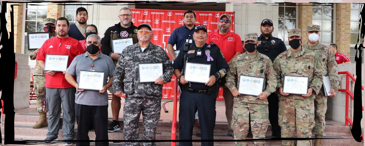
Martin High School hosted a Veterans Day Ceremony where they honored veterans with a certificate of appreciation.