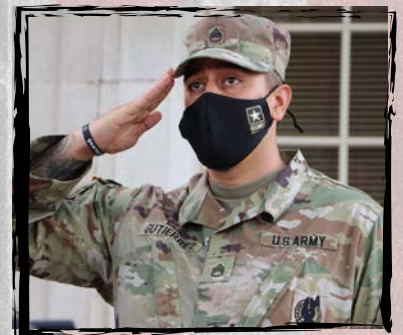
Martin High School hosted a Veterans Day Ceremony where they honored veterans with a certificate of appreciation.