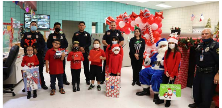
The LISD Police Department Blue Santa's sleigh made a stop at Milton Elementary School. Santa and his helpers distributed gifts to students.