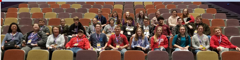
Above are our Juniors at UW Stevens Point for a tour of the college.

We are gearing up for the 2 nd annual Youth Apprenticeship program and breakfast! We are so excited to have this program available to our students, parents and community. If you would like