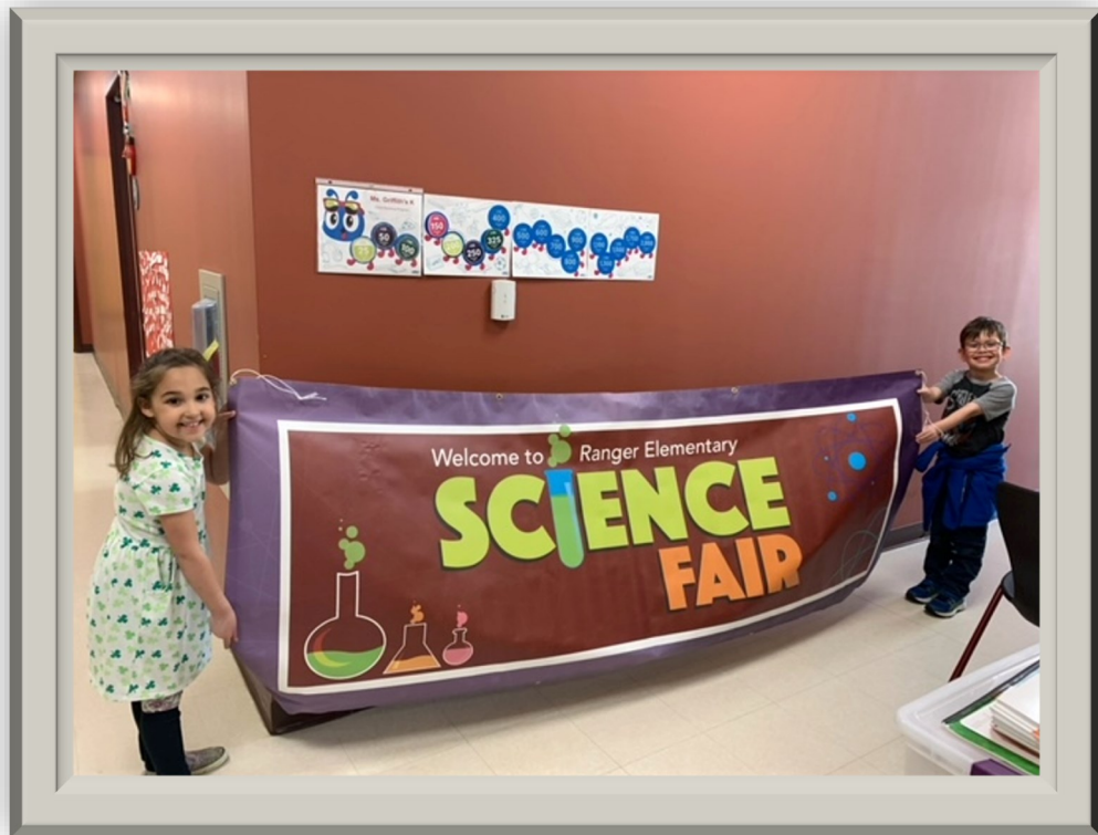
This was a FUN opportunity to do a science project and present it to family and friends!