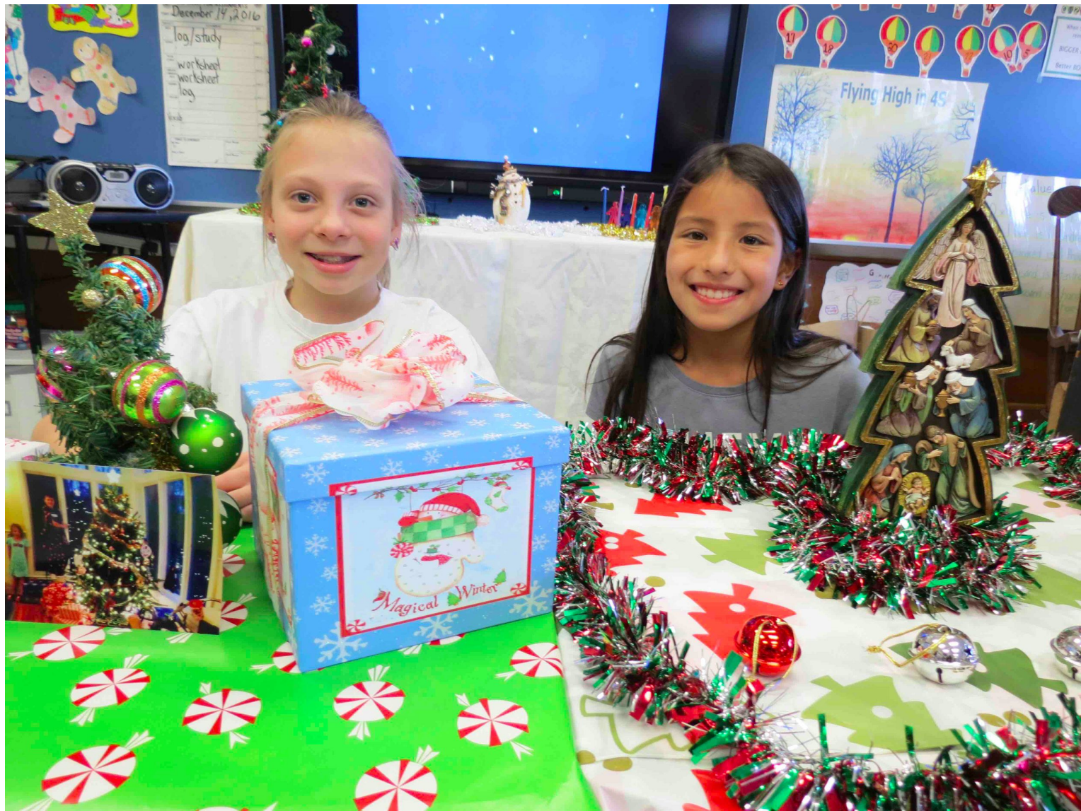
Fourth Grade Holiday Museum