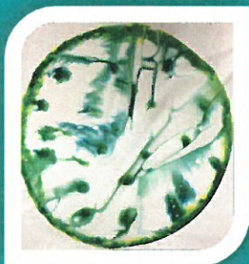
Teaching color theory by mixing two primary colors to obtain a secondary color: K-4th grade create various color-mixing pieces.