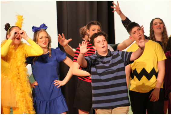
YOU'RE A GOOD MAN, CHARLIE BROWN The cast and crew of You're a Good Man, Charlie Brown brought the Peanuts bunch to life as they explored life's greatest questions.