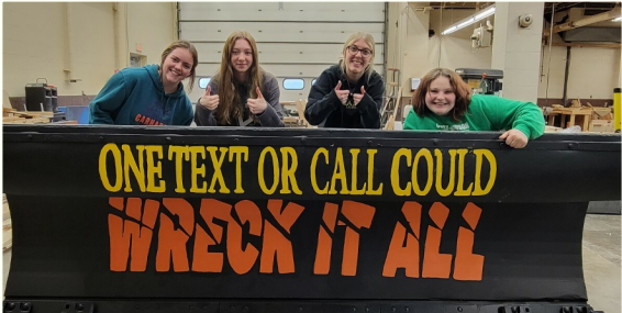
PAINT THE PLOW OVERALL CHOICE WINNER The CRHS ODOT Paint the Plow submission won the state Overall Choice award.