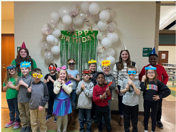
ELEMENTARY SCHOOL CELEBRATES 10 YEARS In March 2023, we celebrated the tenth anniversary of the new elementary building with special lunch treats, a banner, and with CRHS students visiting their elementary classrooms from 2013.

✓ Thank you voters! Income tax renewed in May election