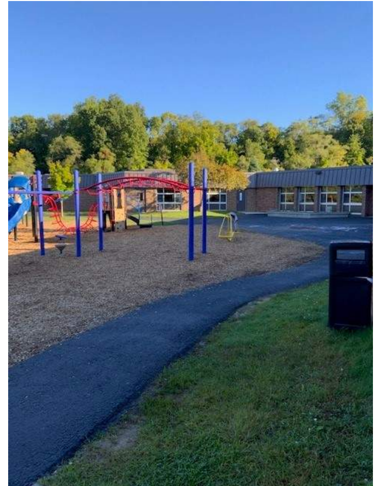
Asphalt pathways have been seal coated