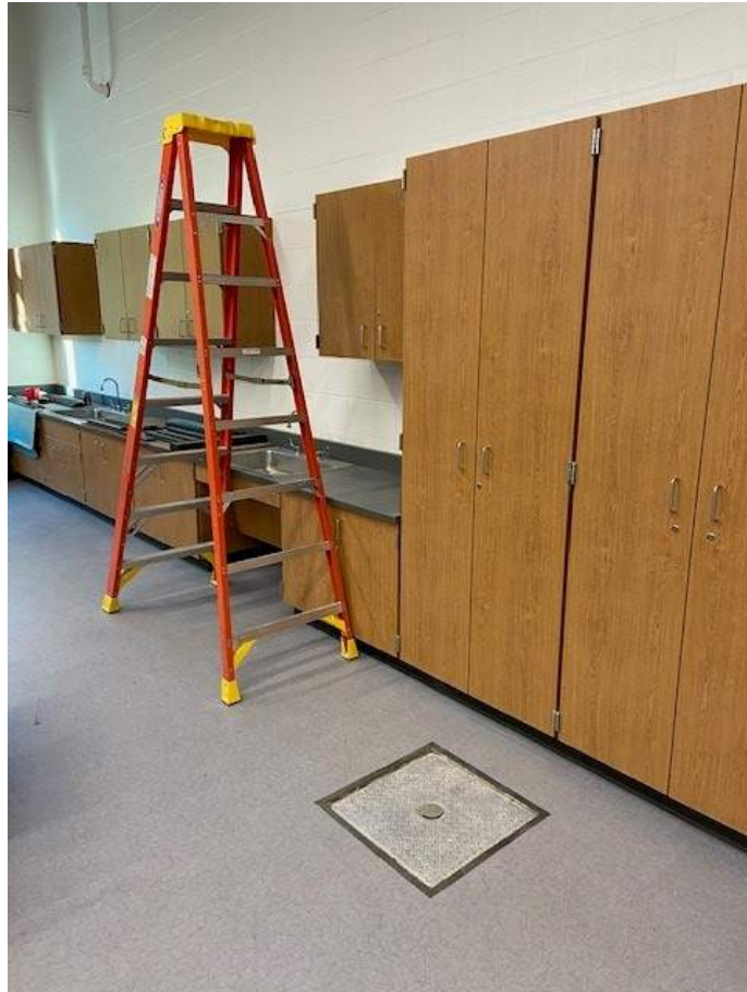
Manufactured Casework in the New Art Classroom is installed