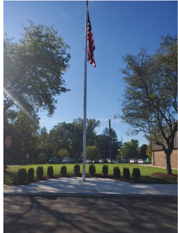
New Flagpole and finished landscaping near the Secured Entrance Addition