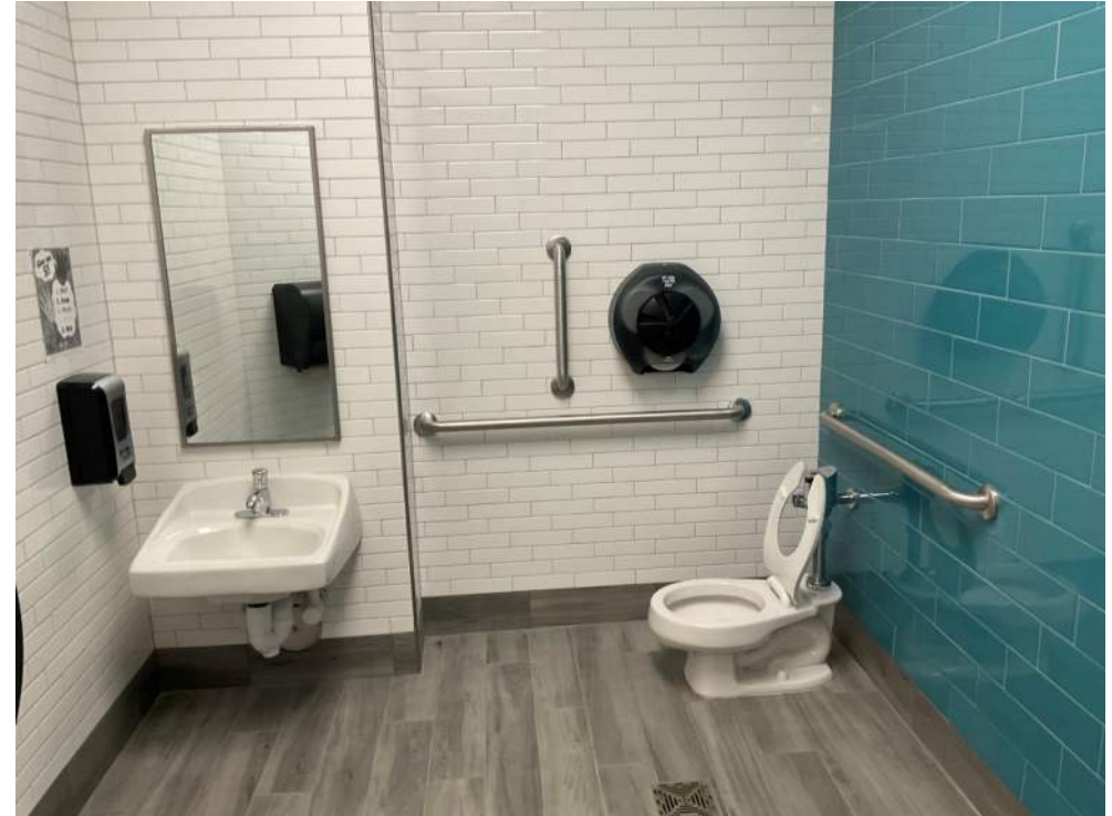
Typical toilet room finishes in (12) added toilet rooms