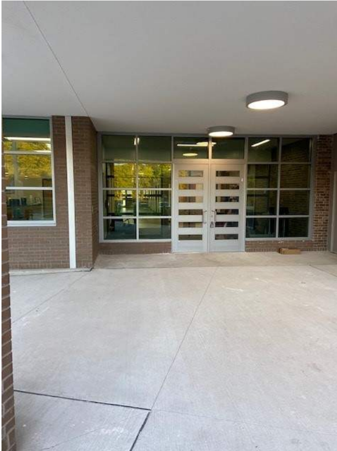
Storefront Aluminum Windows and Entrance Doors are installed