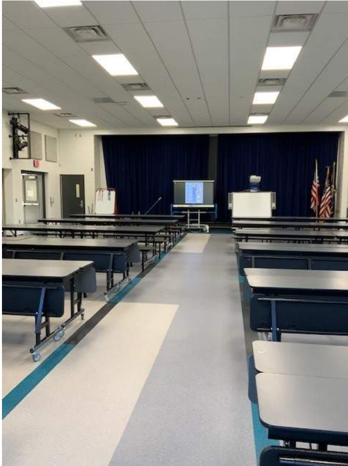
Cafeteria renovation is complete