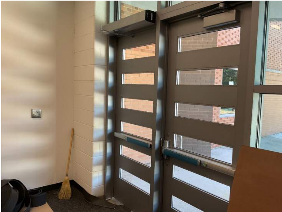
Exterior Aluminum Entrance Doors are installed