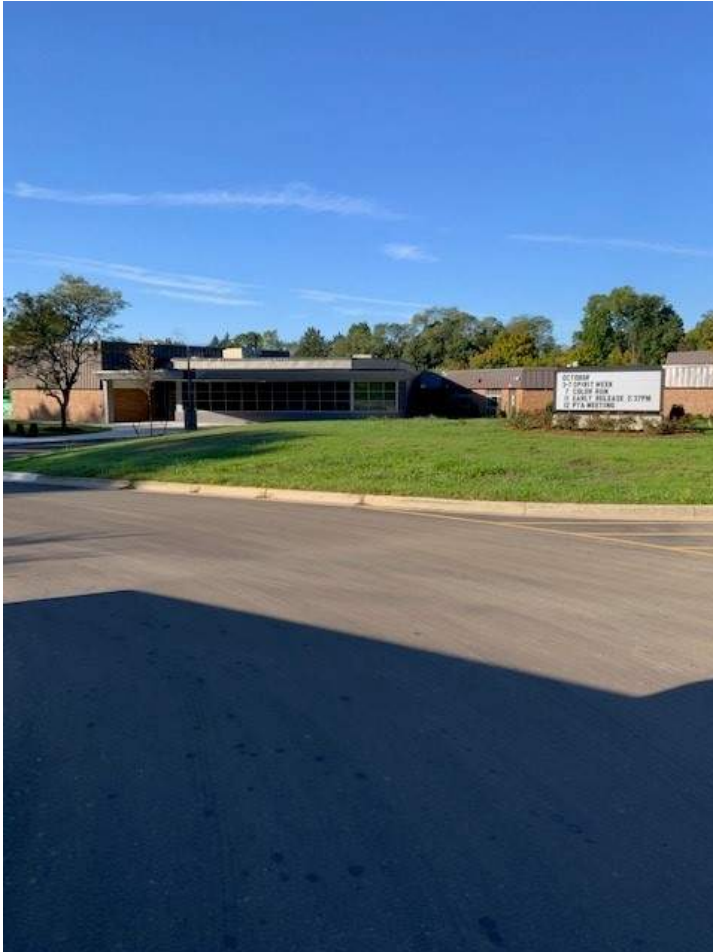
Monument sign and paving is complete at the Secured Entrance Addition