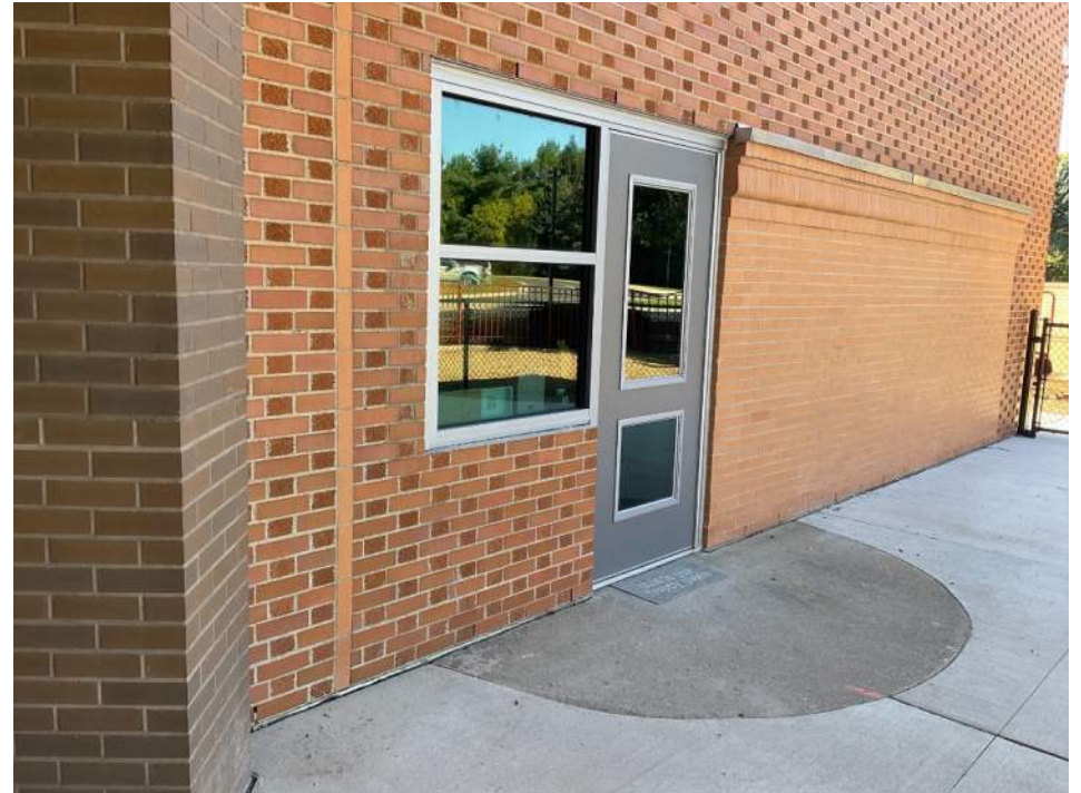
FRP Egress Door and Sidelight at Classroom K-04 is installed