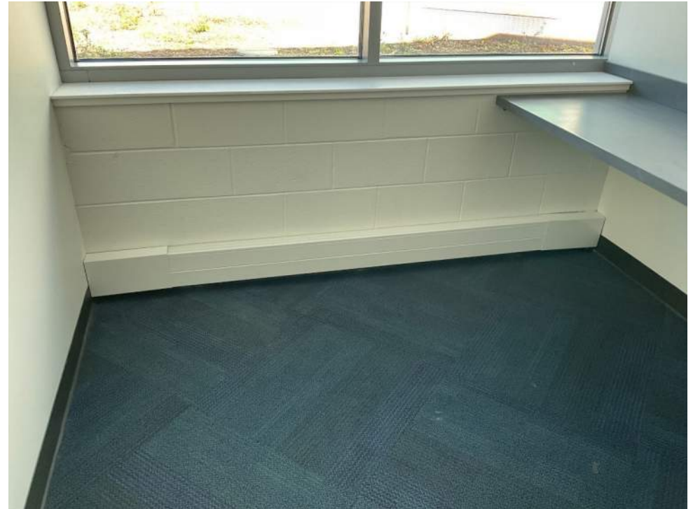
Runtal Perimeter Heating Elements installed in the Secure Entry Addition