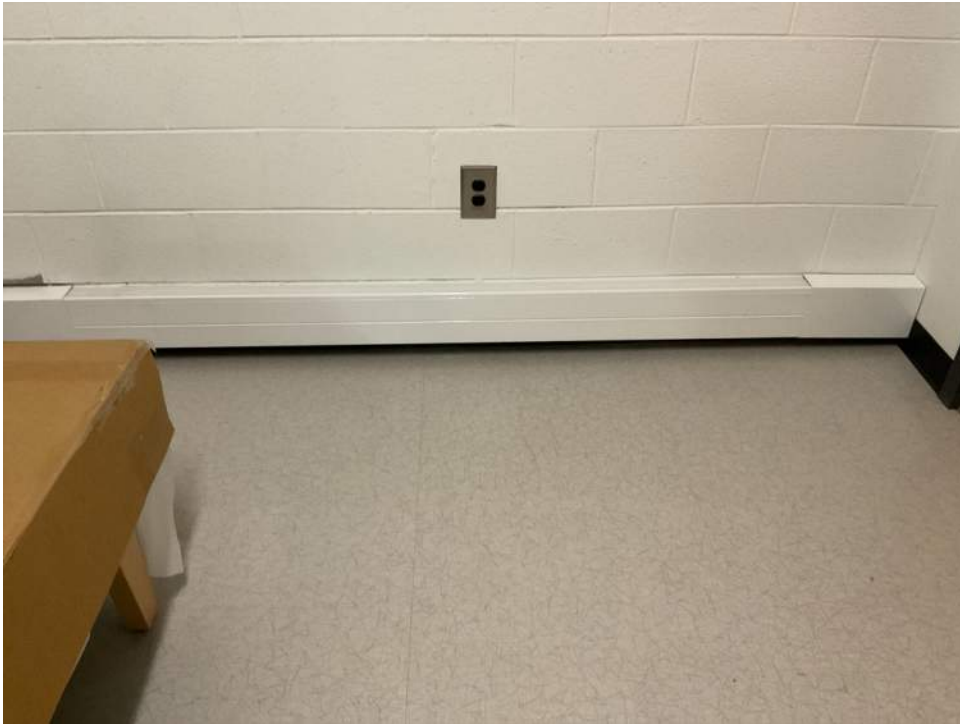
Runtal Perimeter Heating Elements are installed in the Secured Entry Addition