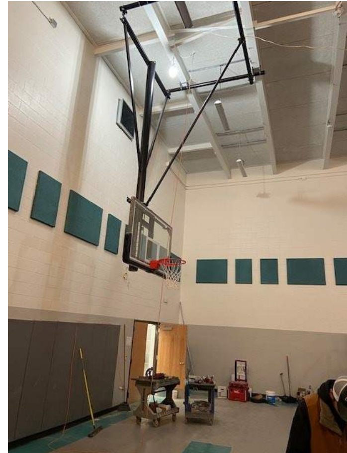
Light fixtures are being installed in the new Gymnasium