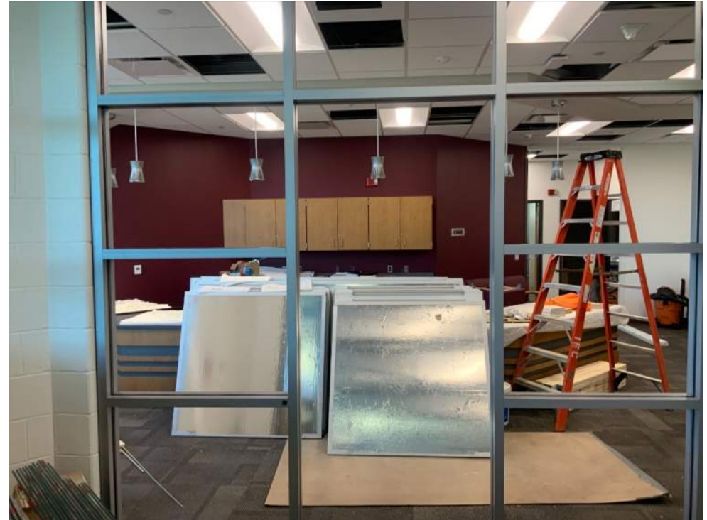
Interior Aluminum Window Framing is being installed at the Secured Entrance Addition