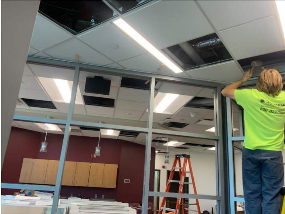
Interior Aluminum Window Framing is being installed at the Secured Entrance Addition