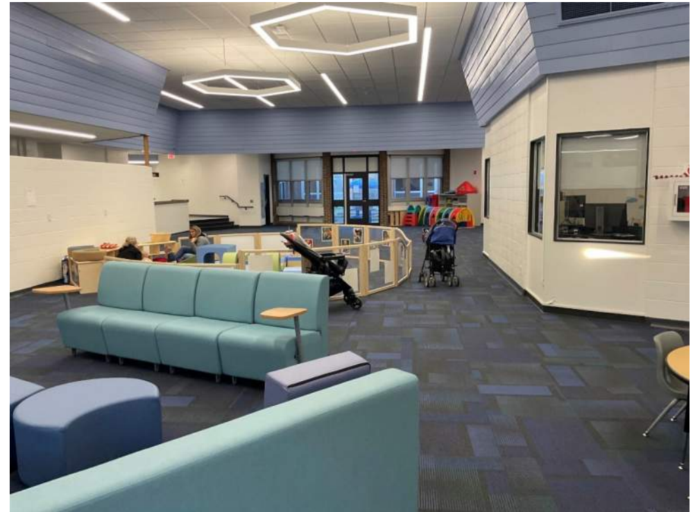
Completed Media Center