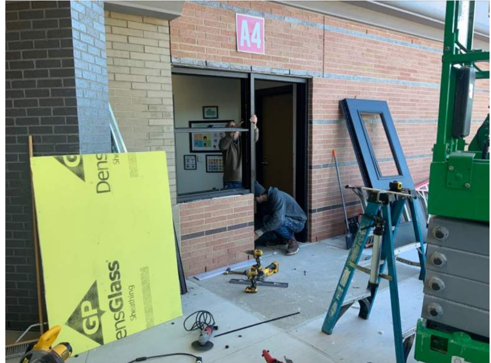
FRP Egress Door and Sidelight at Classroom D-8 is being installed