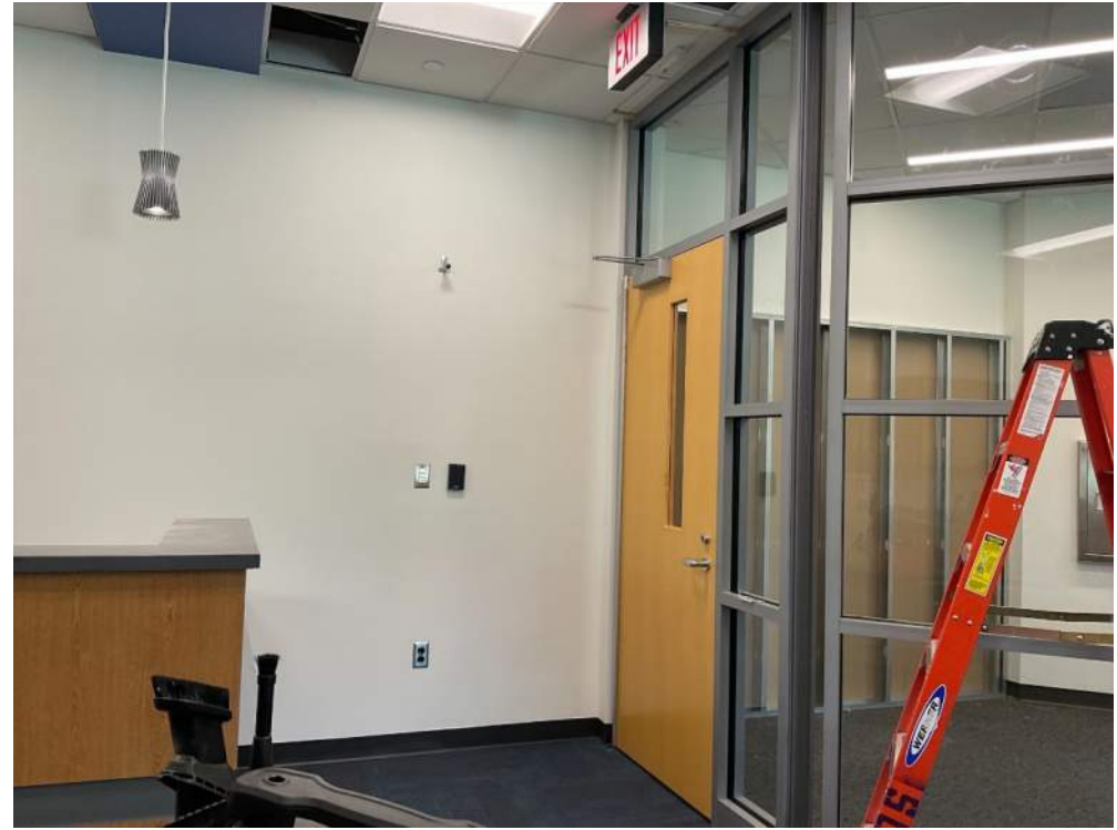
Storefront aluminum windows and wood door from Reception out to Corridor are installed