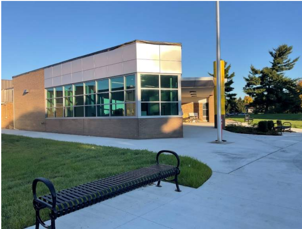
Metal panels are complete at the Secured Entry Addition