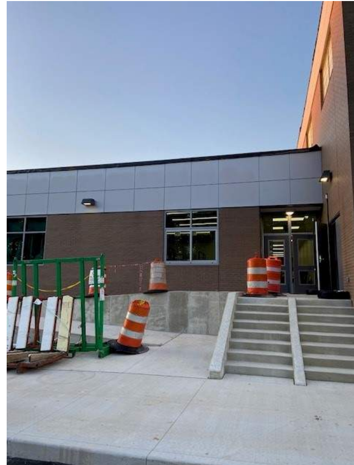
Aluminum Windows and FRP Doors are installed at new the Gymnasium and Classroom Addition