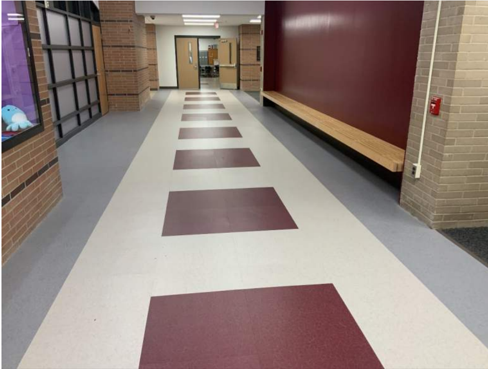
Millwork bench across from business offices is installed