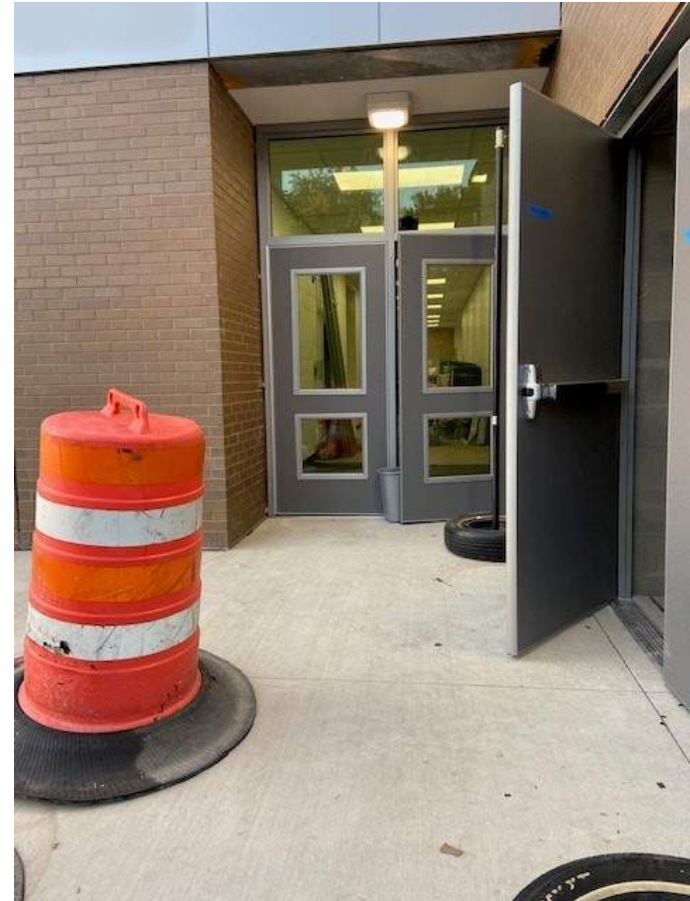
FRP Entrance Doors into Gymnasium and Classroom Addition are installed