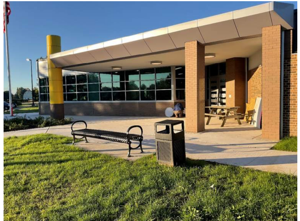
Beveled Metal Soffit Panels at the Entrance Canopy are complete