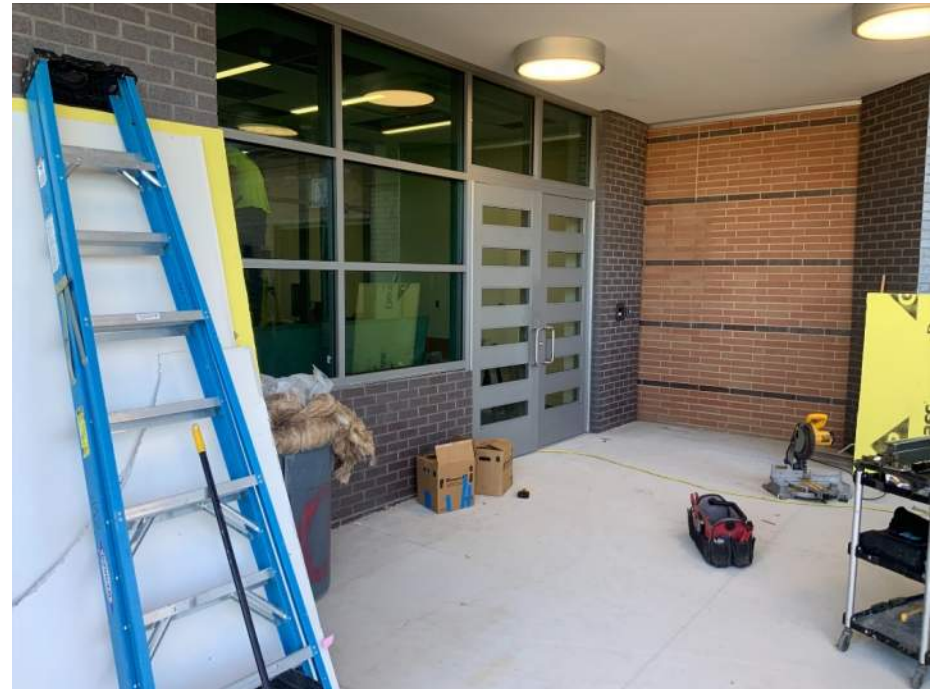
Exterior Aluminum Doors are installed at the Secured Entrance Addition