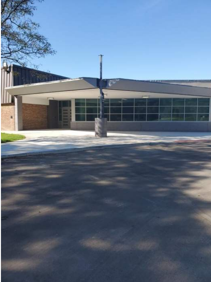
Secured Entry Addition Exterior is complete except for metal panels and metal copings