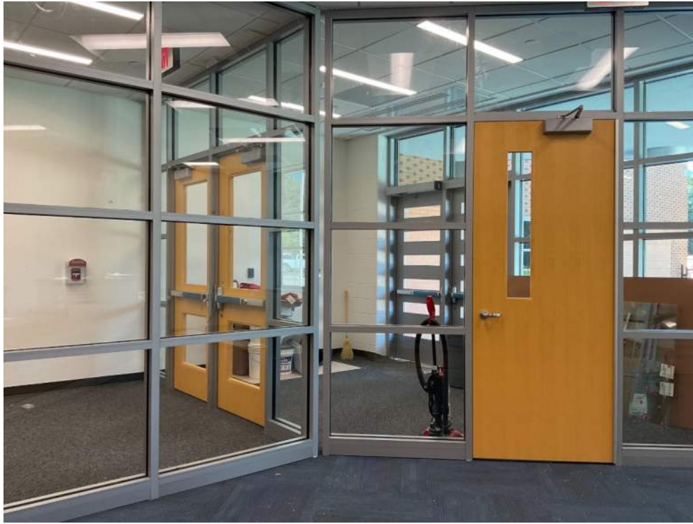
Storefront aluminum windows and entrance vestibule doors are installed