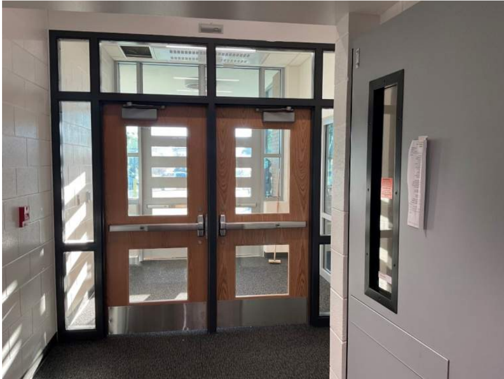
Entrance vestibule doors and hardware are complete