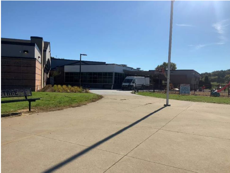
Secured Entry Addition enclosure is complete except for metal panels and metal copings