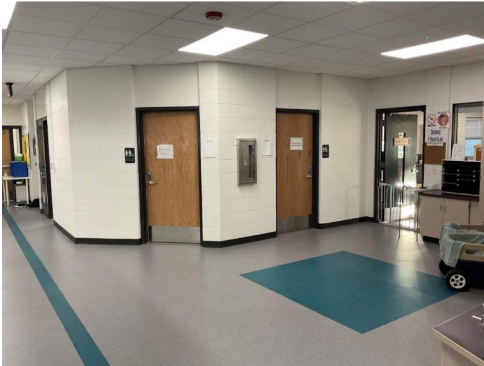
Typical added toilet rooms at each of the Centurms