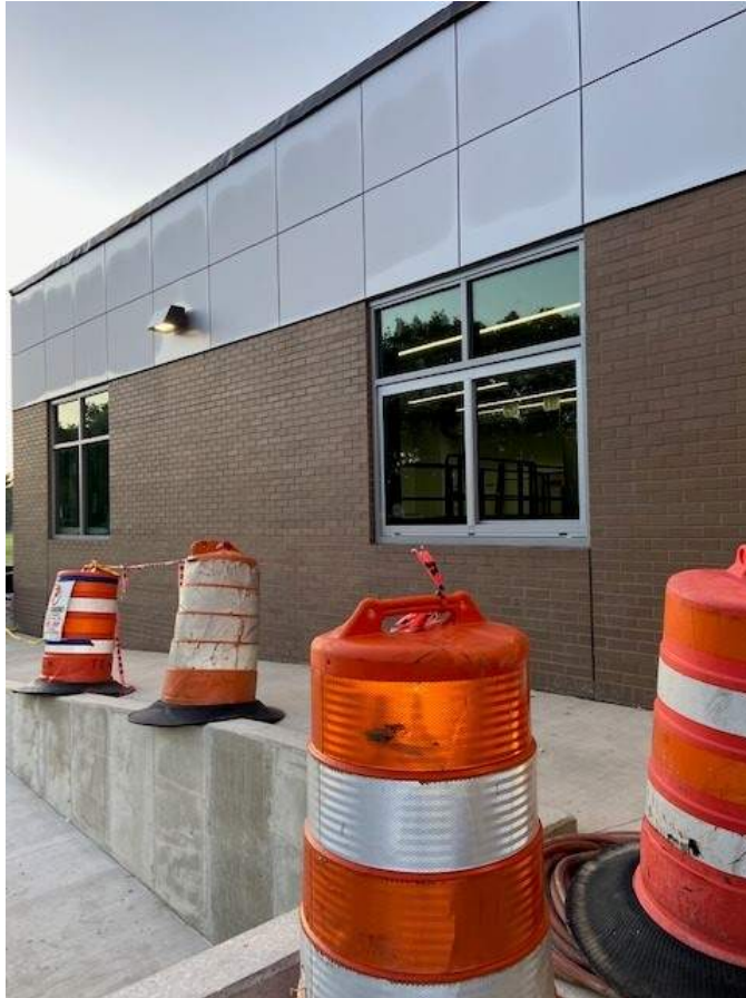
Metal panels and windows are installed at the New Classroom Addition