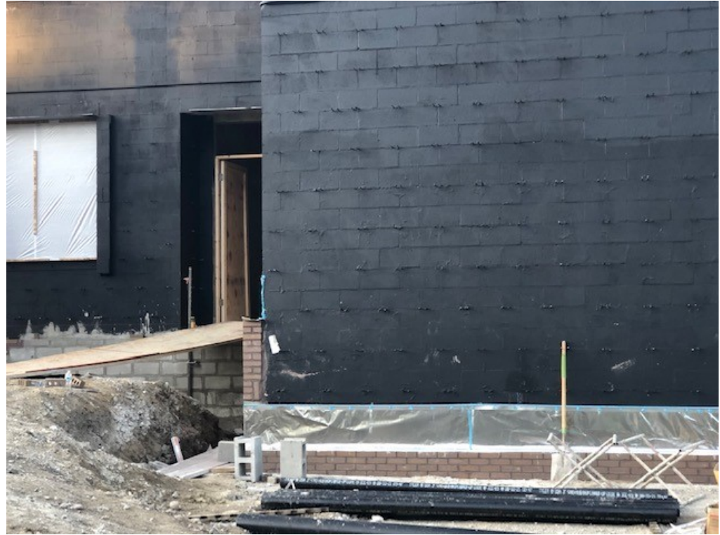
North Elevation of Gymnasium with Damproofing, Brick and Through-Wall Flashing at Ramp being installed