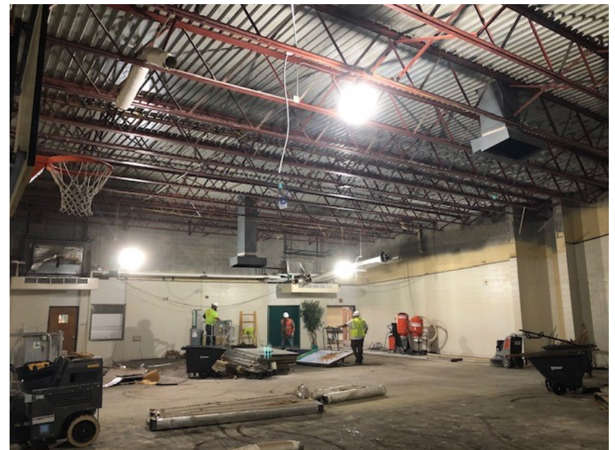
Demolition is progressing in the Old Multi-Purpose Room - Zone A