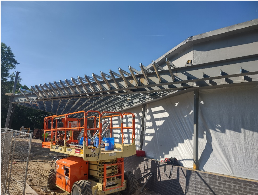
Cold Formed Metal Framing for Canopy Eyebrow is being installed