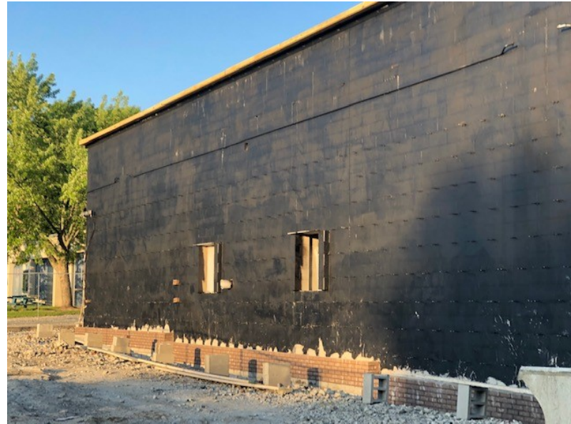
East Elevation of Classrooms - Damproofing, Brick and Wood Blocking at the Parapet Cap is being installed