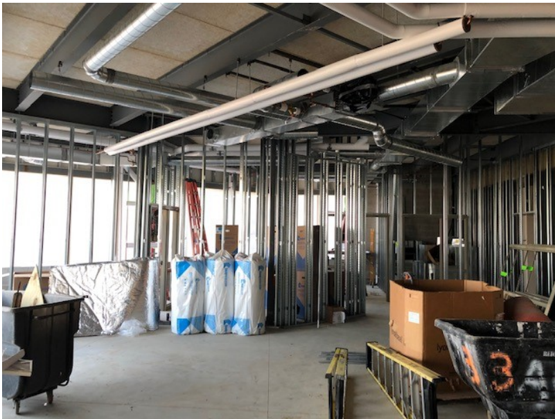
Overhead Piping, Ductwork and Metal Stud Walls are being installed in the Secured Entry Addition