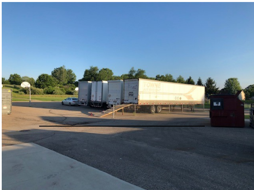
Storage Trailers have been Mobilized for Move-out of Furniture & Furnishings