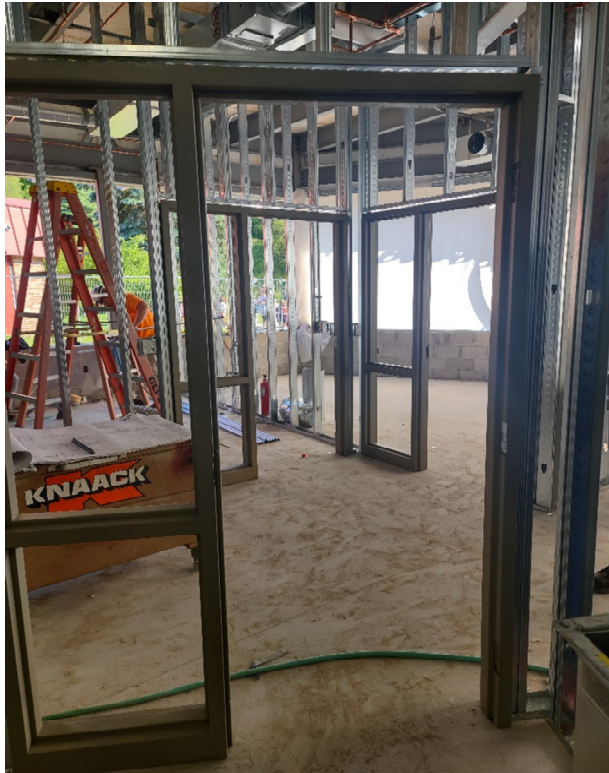
Hollow Metal Door Frames with Sidelights have been set for Offices in the Secured Entrance Addition