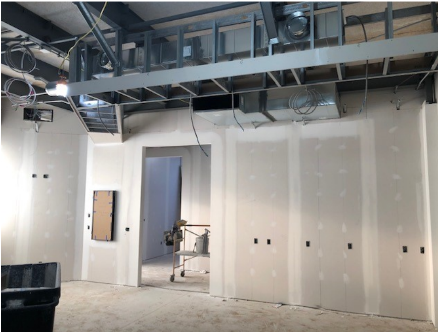
Drywall Finishing is progressing in the Secured Entry Addition Reception Room