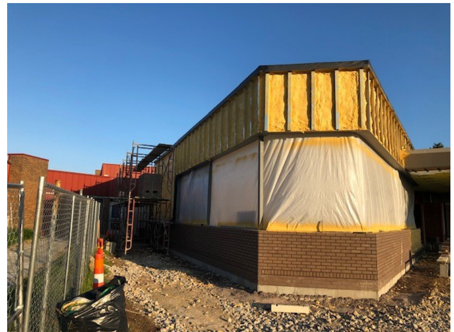
South Elevation of Secured Entry Addition - Brick, Spray Foam and Z-Girts for Metal Panel are being installed