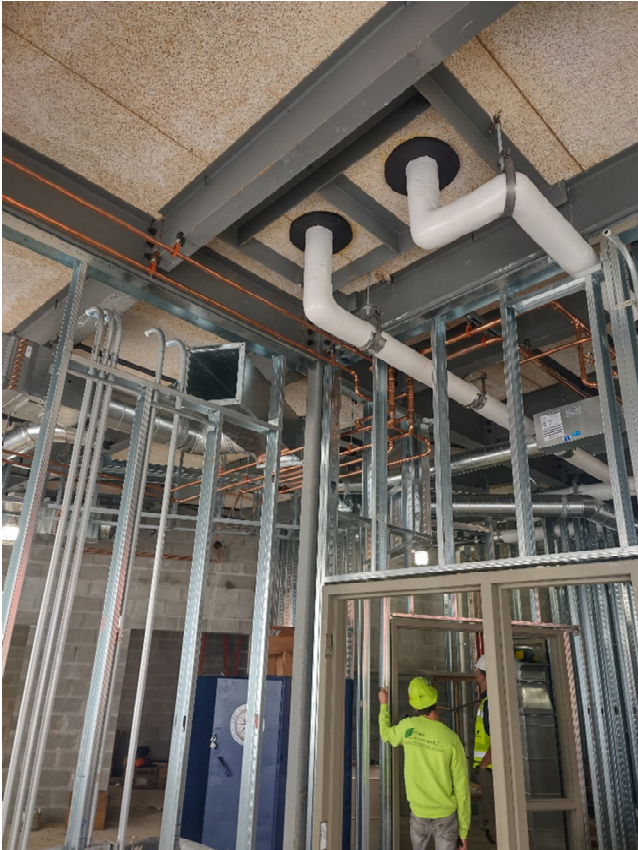
Overhead plumbing, sheet metal duck work and in-wall electrical rough-in are underway in the Secured Entry Addition