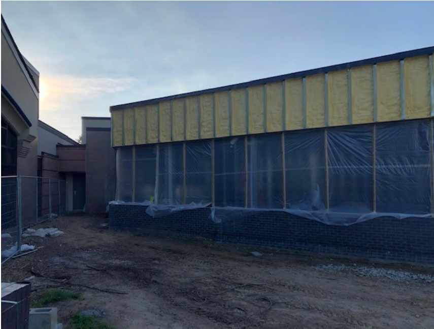
West Elevation of Secured Entry Addition - Brick, Spray Foam, Z-Girts for Metal Panel and Temporary Enclosure are in place