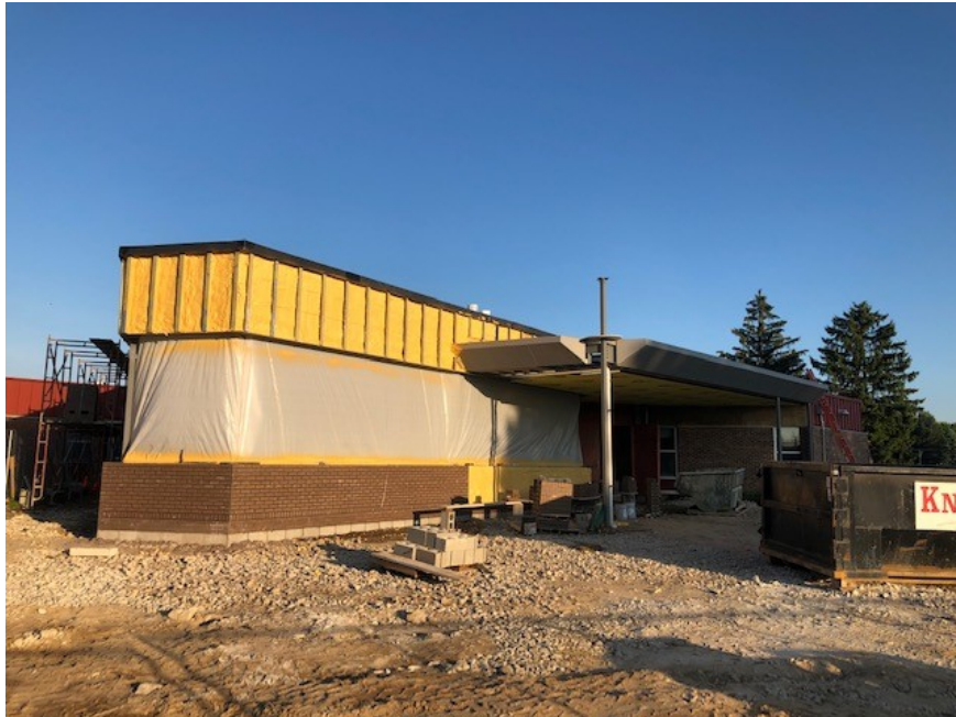
East Elevation of Secured Entry Addition - Brick, Spray Foam and Z-Girts for Metal Panel are being installed