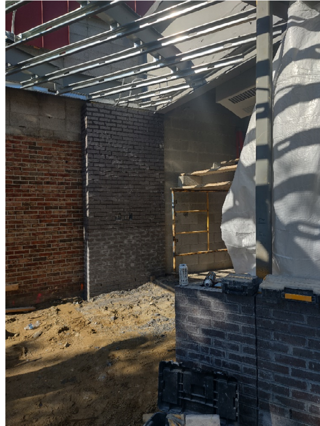
Face brick at the new main entrance is being installed