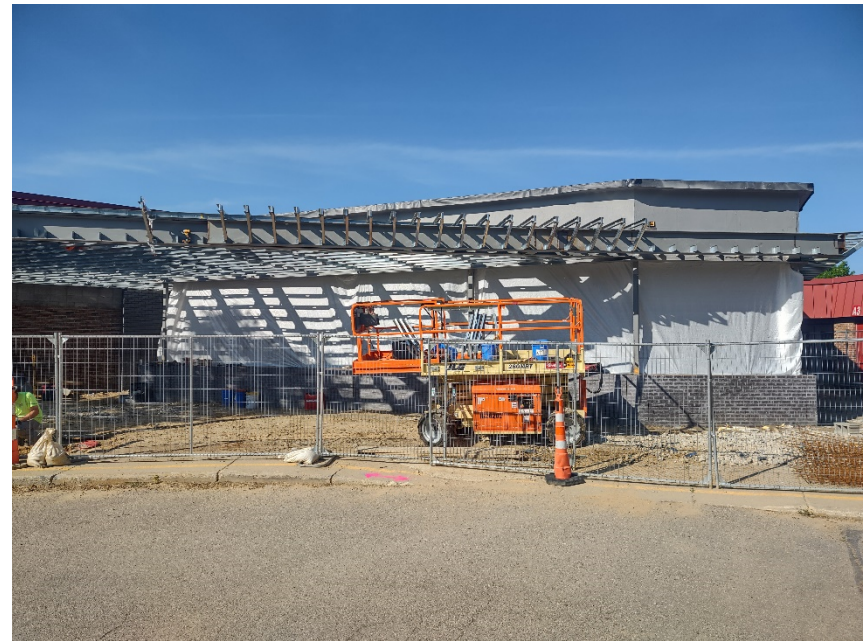
Temporary enclosure of the storefront window openings has been installed to allow finish trade work to continue in the Secured Entry Addition