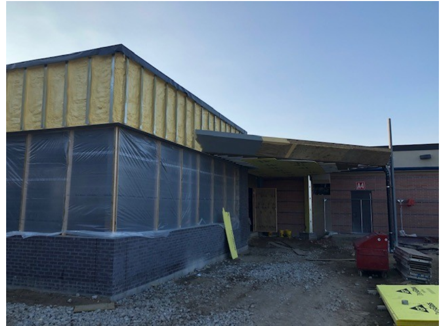
West Elevation of Secured Entry Addition - Canopy Wood Blocking & Temporary Enclosure are in place