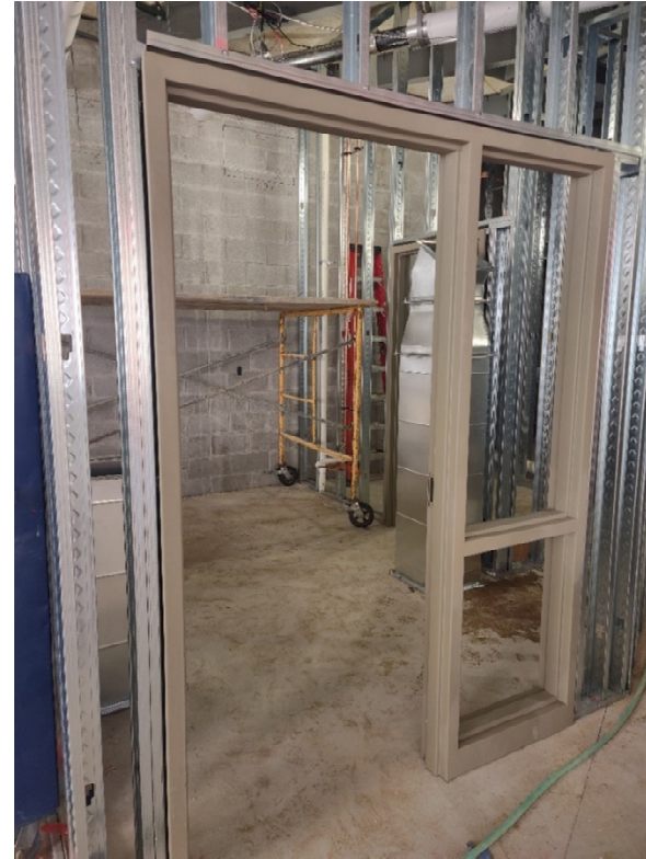
Hollow Metal Door Frames with Sidelights have been set for Offices in the Secured Entrance Addition