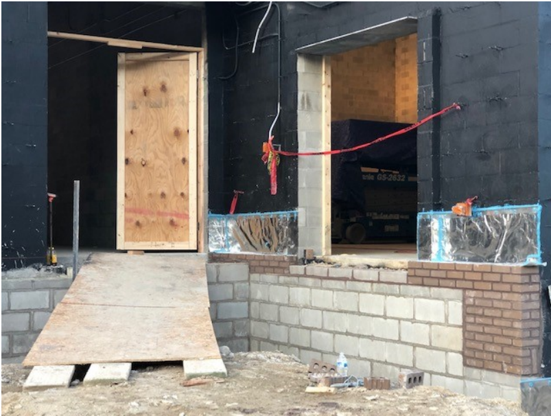
North Elevation of Gymnasium with Damproofing, Brick and Through-Wall Flashing at Ramp being installed