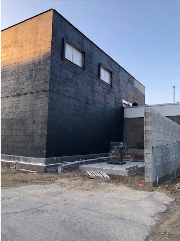
North & West Elevations of Gymnasium with Damproofing, Brick and Through-Wall Flashing being installed