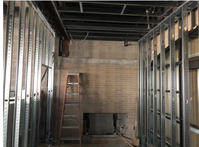
Metal Stud Walls are being built at Tie-in with the Secured Entry Addition