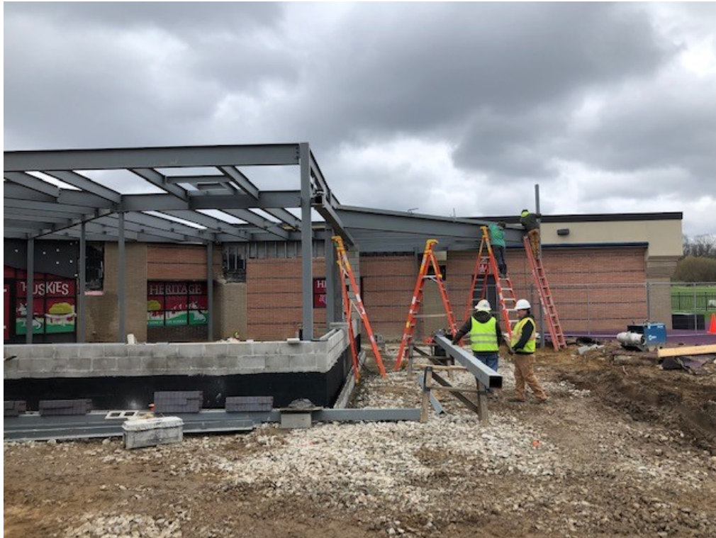
Ironworkers are completing detailing of entrance canopy steel and tube steel lintels