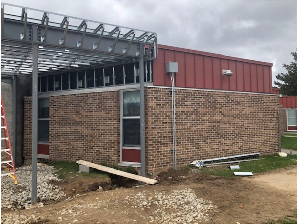
Electrical service to Apollo monument sign is installed