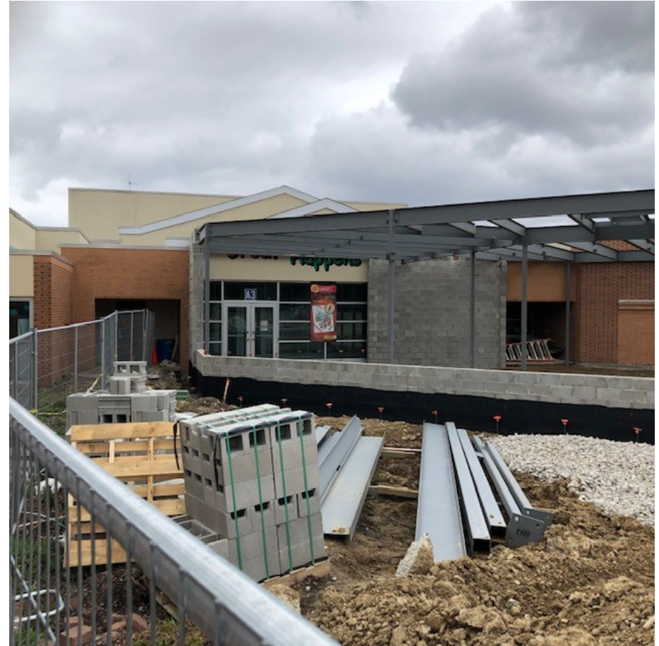
Steel framing for the entrance canopy is remaining to be erected