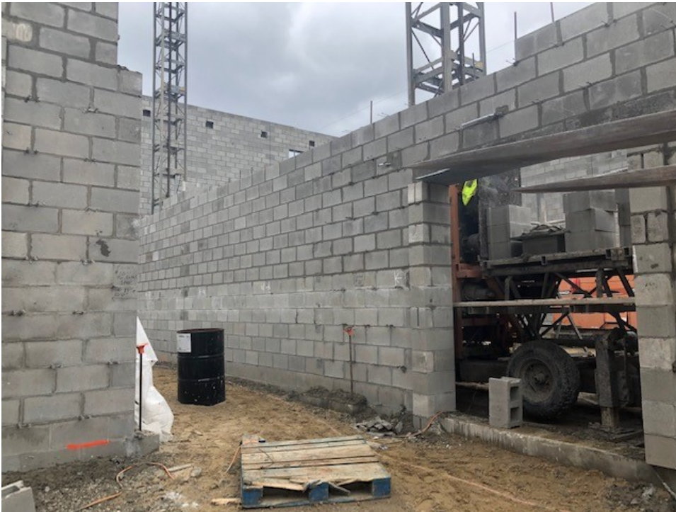
East wall of the new gymnasium is 50% complete