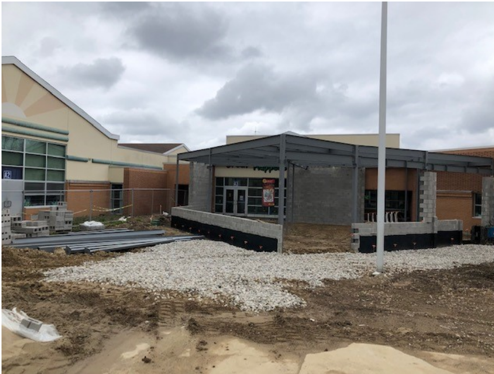
Structural Steel Framing is 75% complete; exterior masonry walls are underway; damp proofing is being applied at base of masonry walls