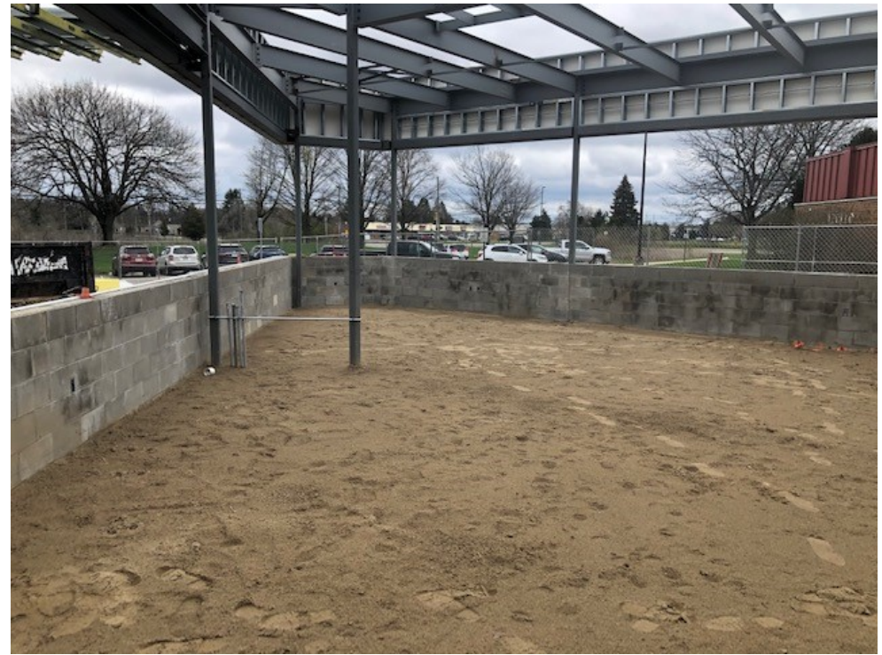
Sand prep and underslab electrical and plumbing are installed and ready for floor slab pour.