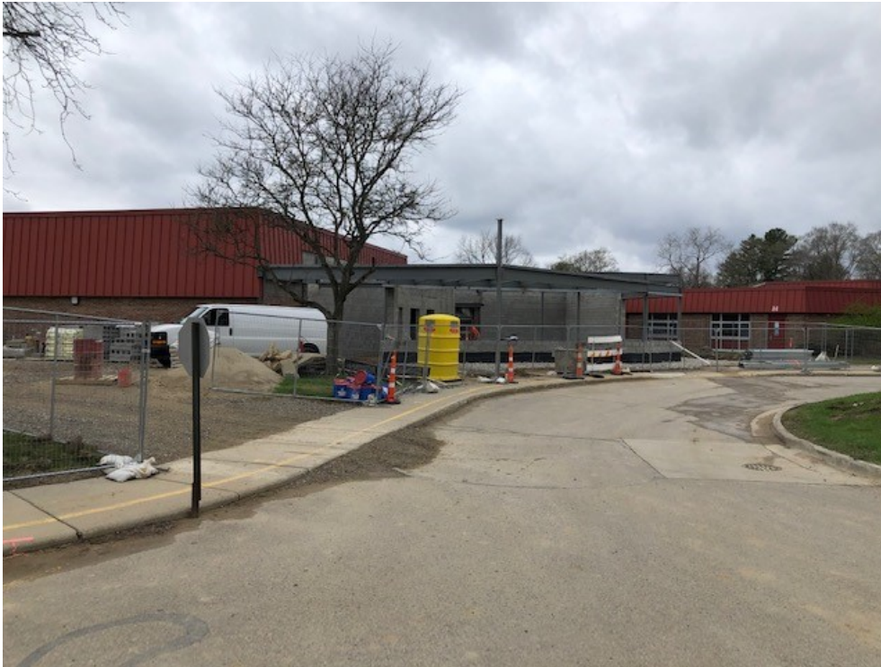
Erection of structural steel framing for Secured Entry Addition is complete and ready for exterior cold formed metal framing to start