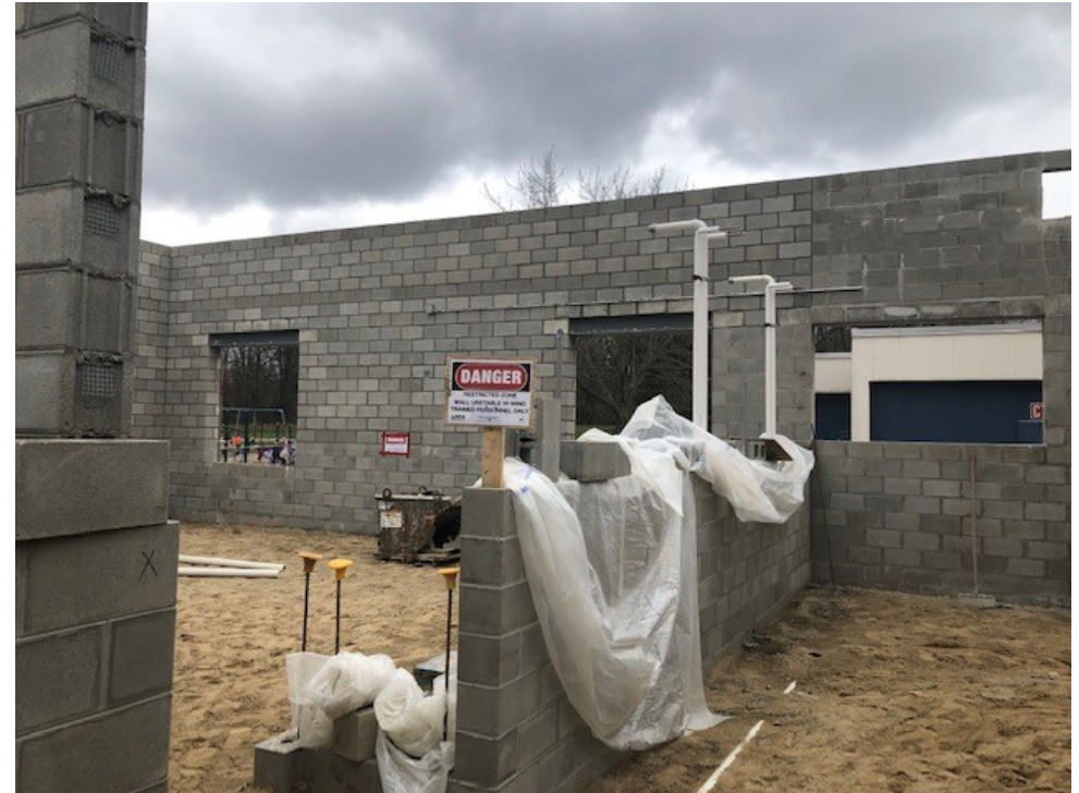
Interior masonry walls for new Art Classroom are being built