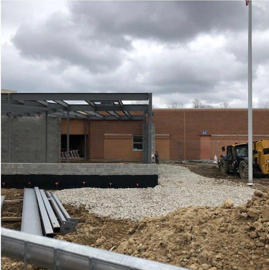
Stone has been placed around the perimeter of the addition to provide a stable base for trades to work safely