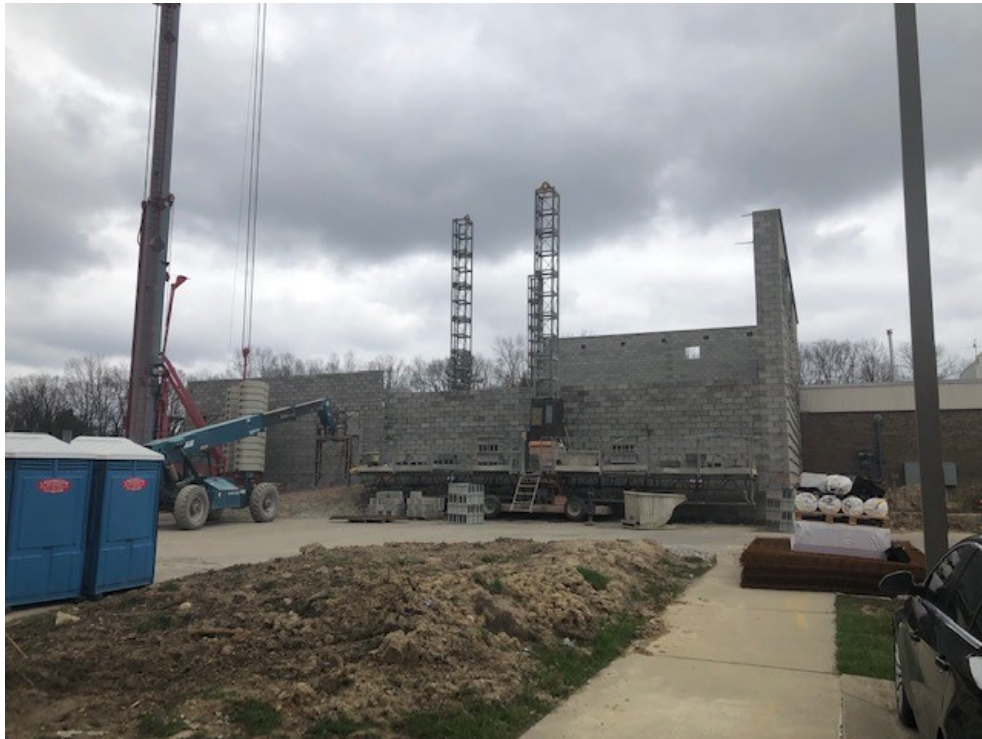
North wall of the new gymnasium is 50% complete