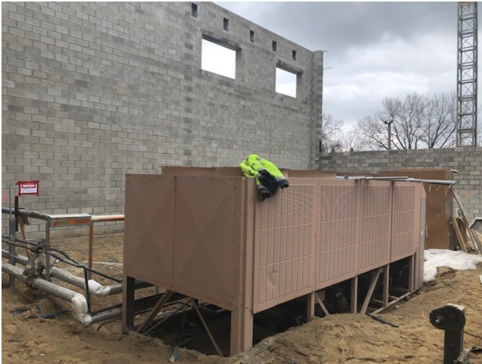
Existing Chiller is being left in place and is in operation until school is out in June