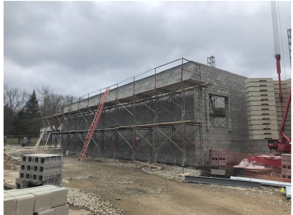
CMU at the east wall of the new Classroom and Art Classroom is topped off