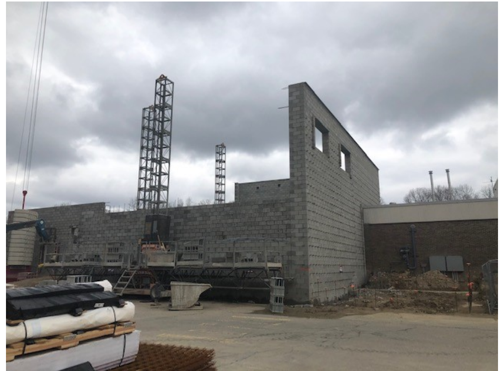
North wall of the new gymnasium is 50% complete