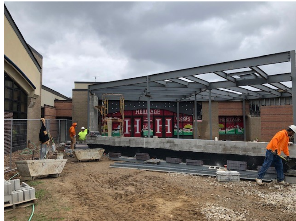
Structural Steel Framing is 90% complete; exterior masonry walls are built; damp proofing has been applied at base of masonry walls and face brick has started