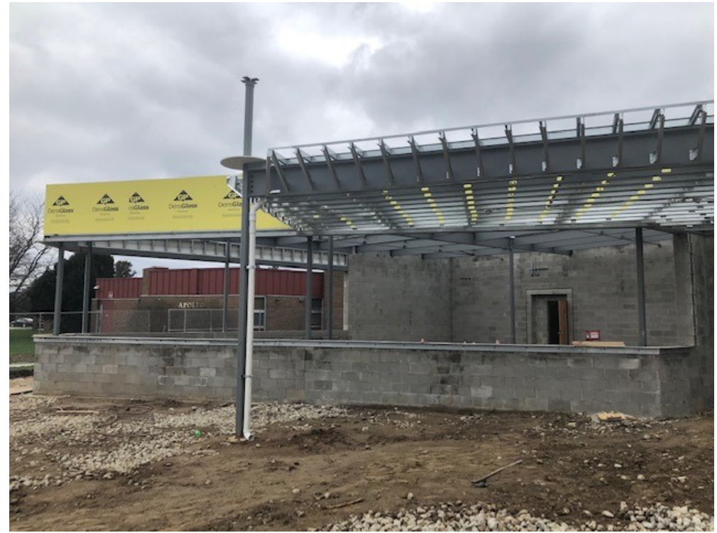
Plumbing drainage piping for canopy roof sump and electrical rough-in for canopy soffit lighting is installed