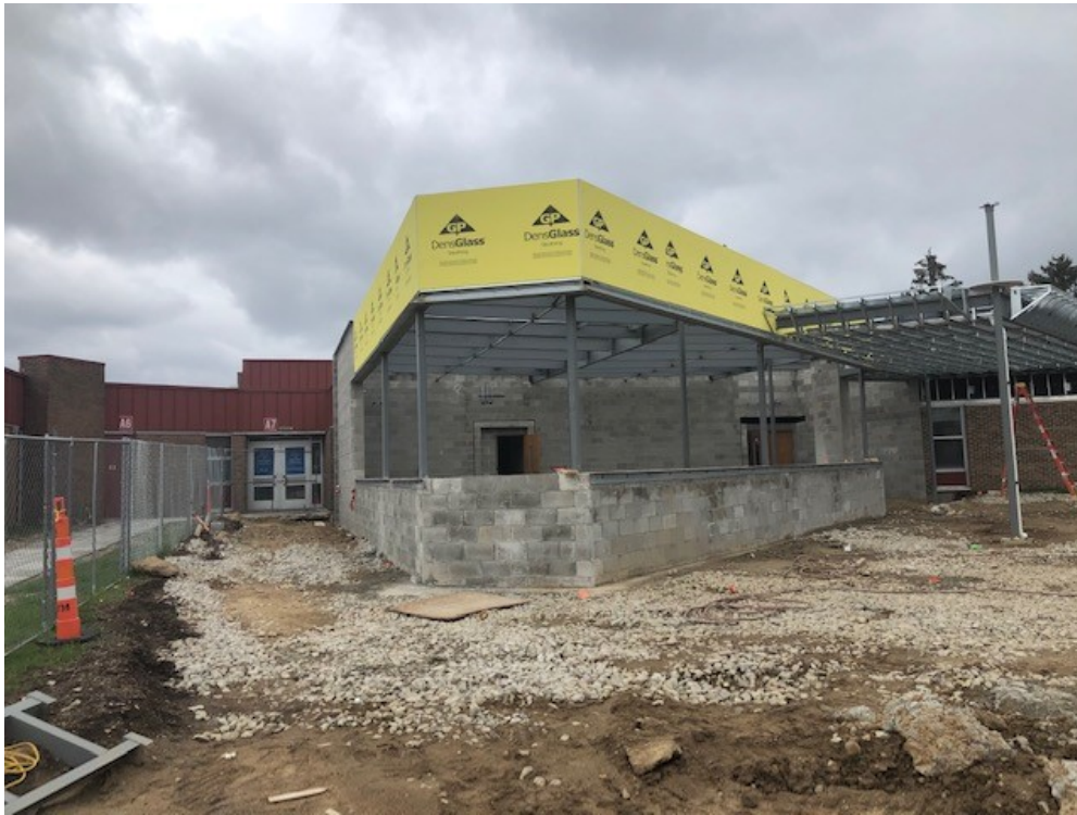
Steel Framing, Cold Formed Metal Stud Framing, Densglass Sheathing and CMU are complete