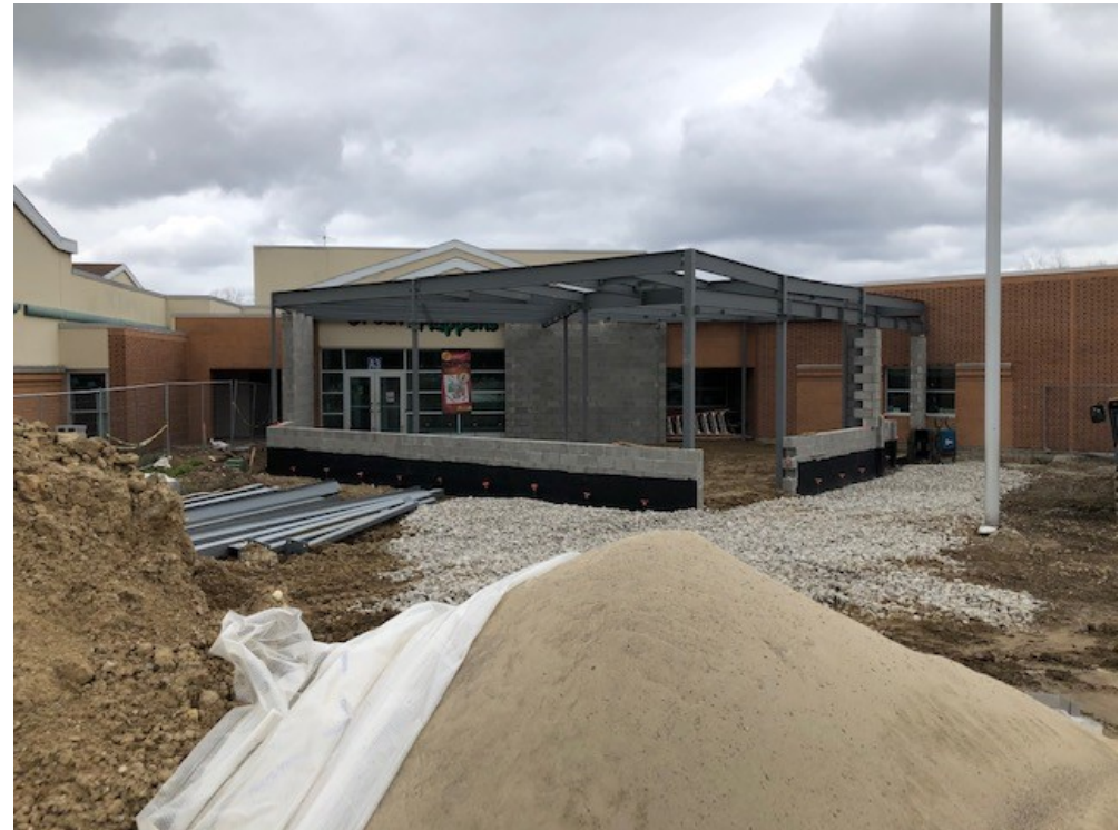
Structural Steel Framing is 75% complete; exterior masonry walls are underway; damp proofing is being applied at base of masonry walls