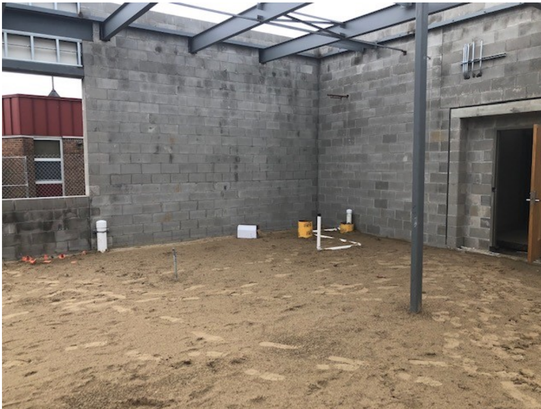
Sand prep and underslab electrical and plumbing are installed and ready for floor slab pour.