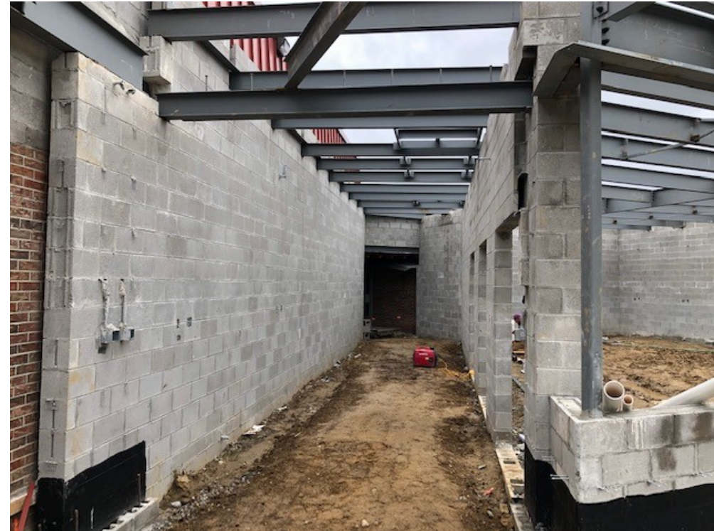
View of new entrance corridor adjacent to Reception and new Main Office area