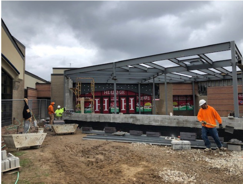
Structural Steel Framing is 90% complete; exterior masonry walls are built; damp proofing has been applied at base of masonry walls and face brick has started