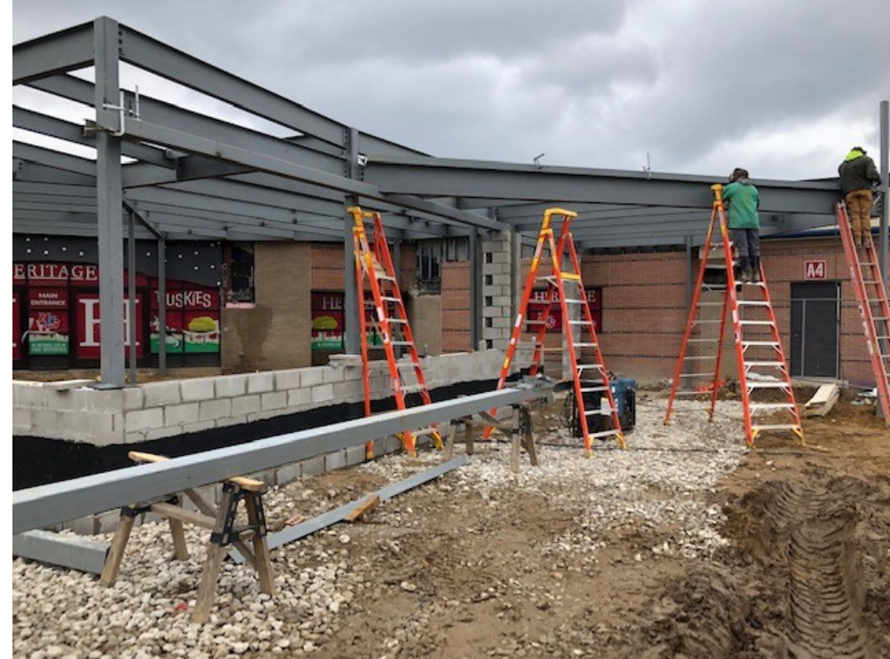
Ironworkers are completing detailing of entrance canopy steel and tube steel lintels