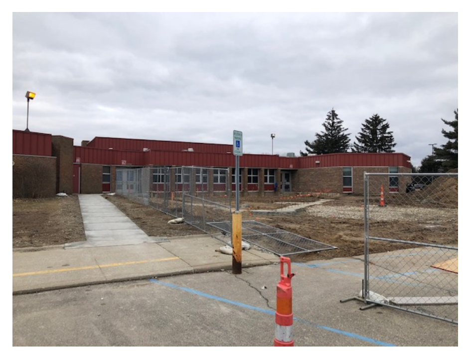
Secured Entry Addition – Temporary Sidewalk in Place for Emergency Egress