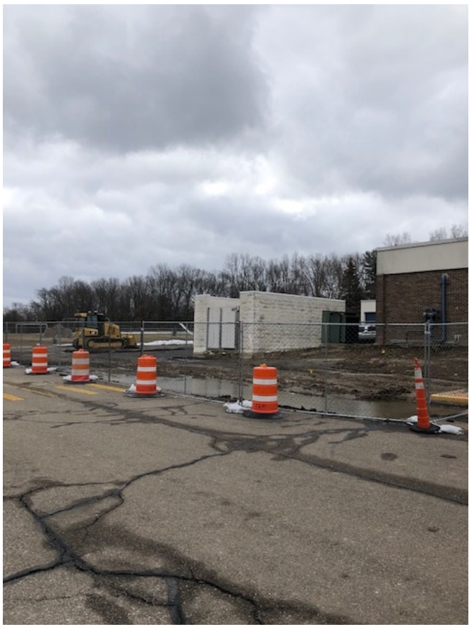
Gymnasium & Classroom Addition – Temporary Fencing to Secure the Site is in Place