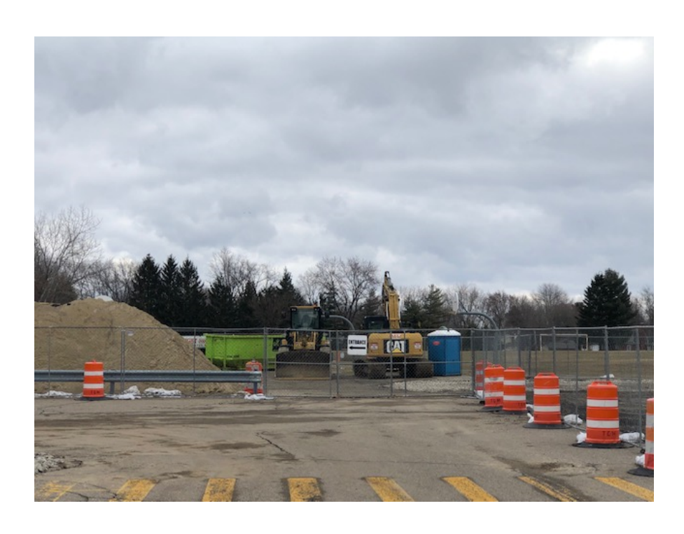
Gymnasium & Classroom Addition – Temporary Fencing to Secure Material and Equipment Staging Area is in Place and Sand Material Has Been Delivered