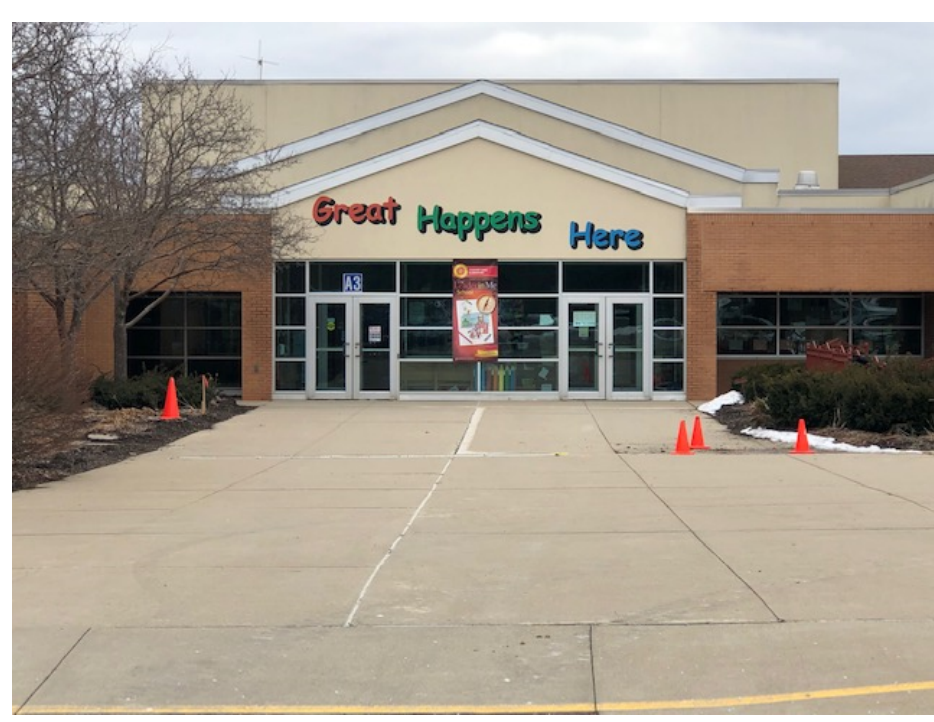
Secured Entry Addition – Site Clearing is Pending Temporary Relocation of Main Entrance and School Offices