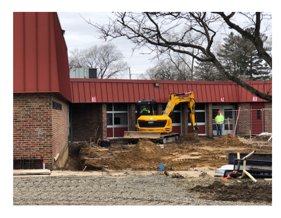
Secured Entry Addition – Excavation for Foundations is Underway