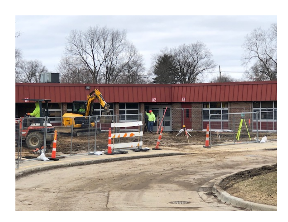
Secured Entry Addition – Site Clearing is Complete, and Foundations are Underway