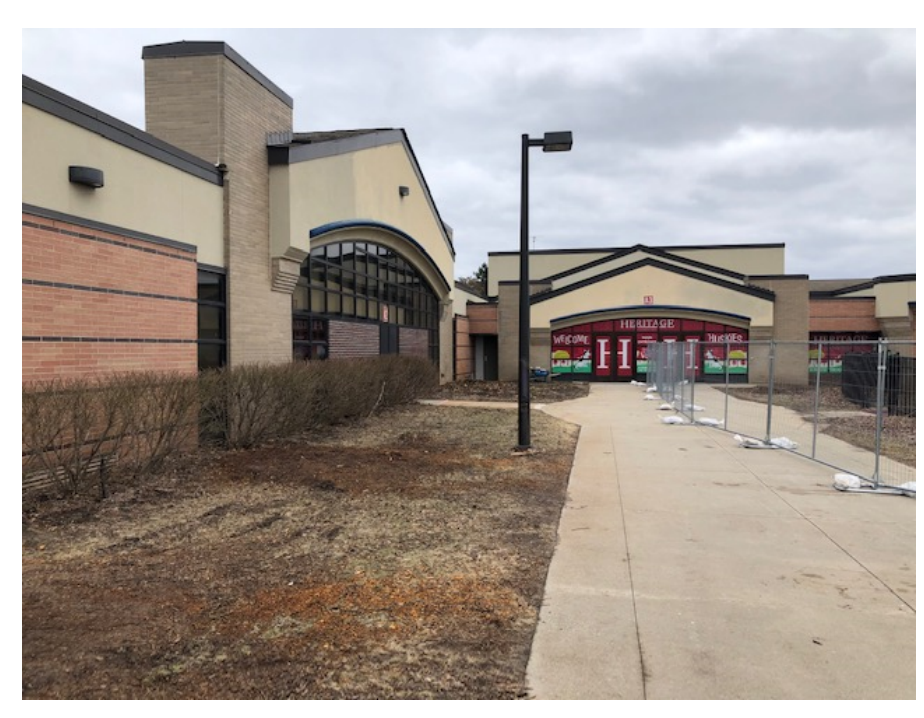
Secured Entry Addition – Trees Removed Adjacent to Existing Main Entrance