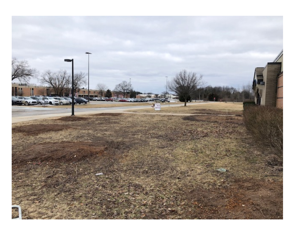
Secured Entry Addition - Trees Removed on West Elevation Adjacent to Temporary Main Entrance