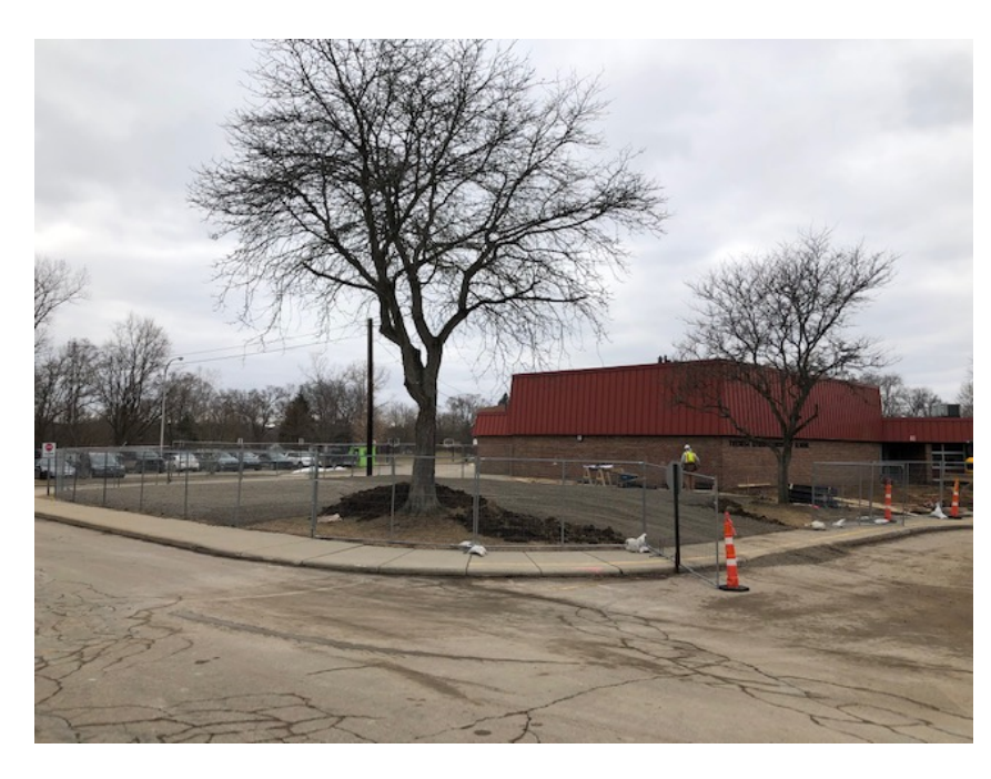
Secured Entry Addition – Staging Area is Established, and Temporary Fencing is in Place