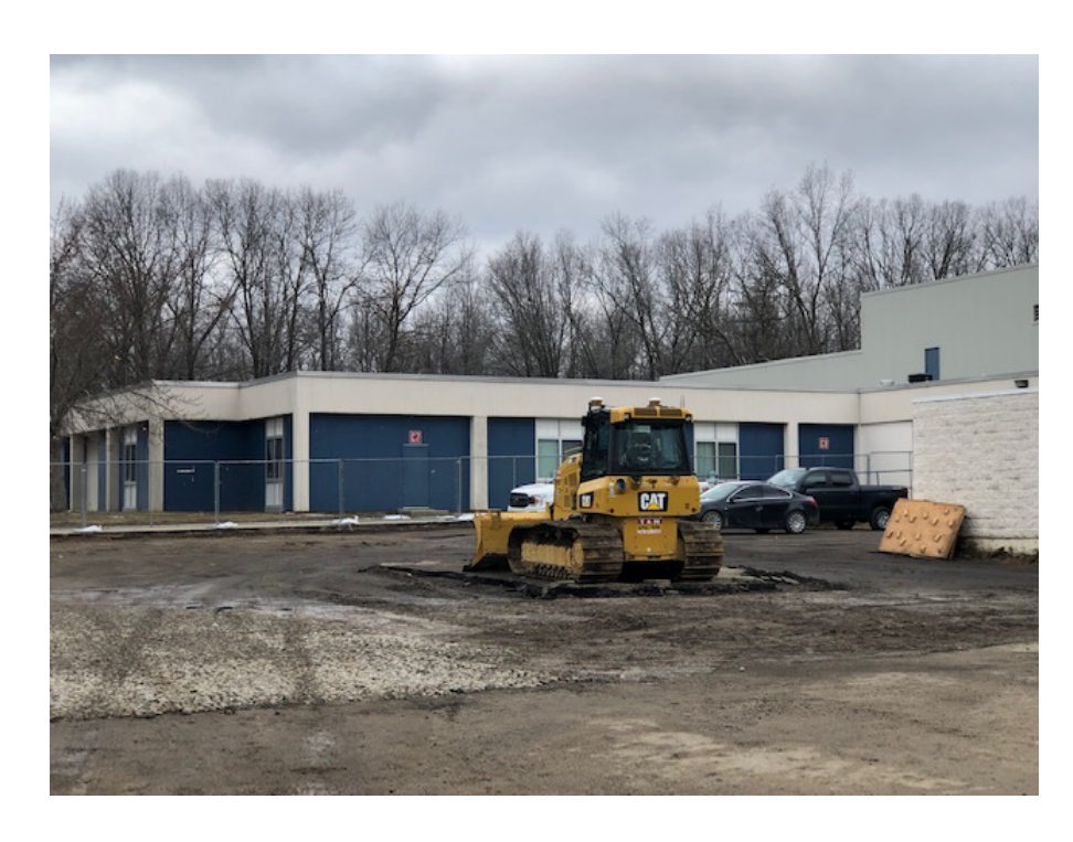
Gymnasium & Classroom Addition – Building Pad After Site Clearing