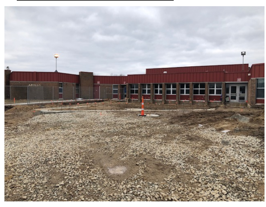
Secured Entry Addition - Foundations Complete