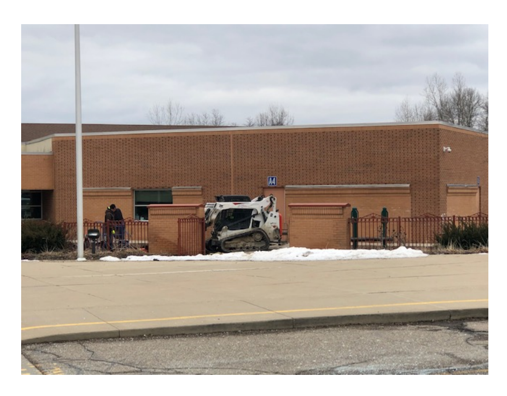
Secured Entry Addition - Removal and Salvaging of Existing Playground Equipment for Relocation