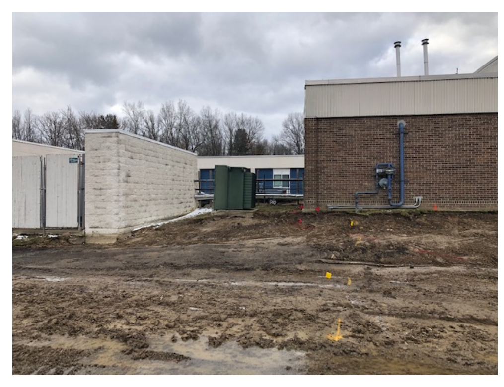
Gymnasium & Classroom Addition – Site Clearing is Complete Except For Removal of Existing Chiller Enclosure