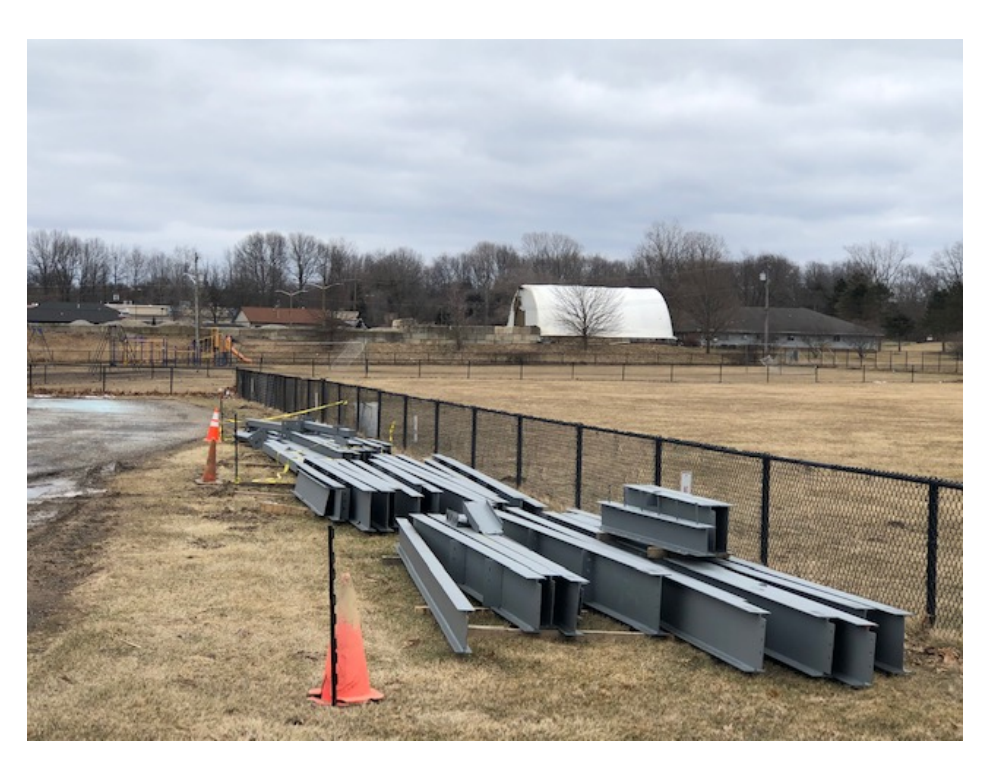
Secured Entry Addition – Structural Steel Framing Material Has Been Delivered to the Site