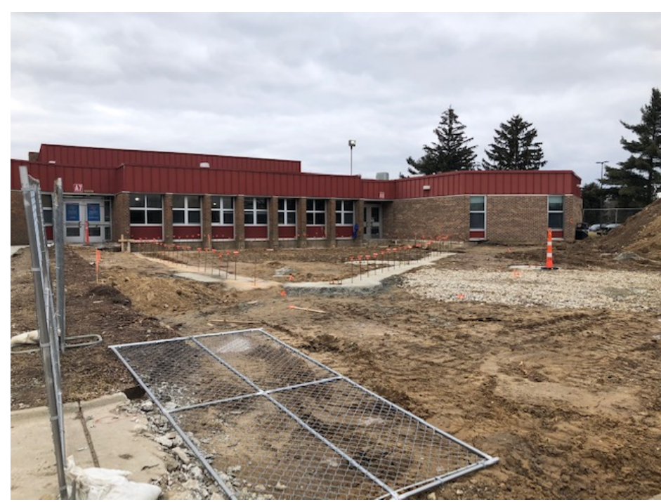
Secured Entry Addition – Site Clearing Complete