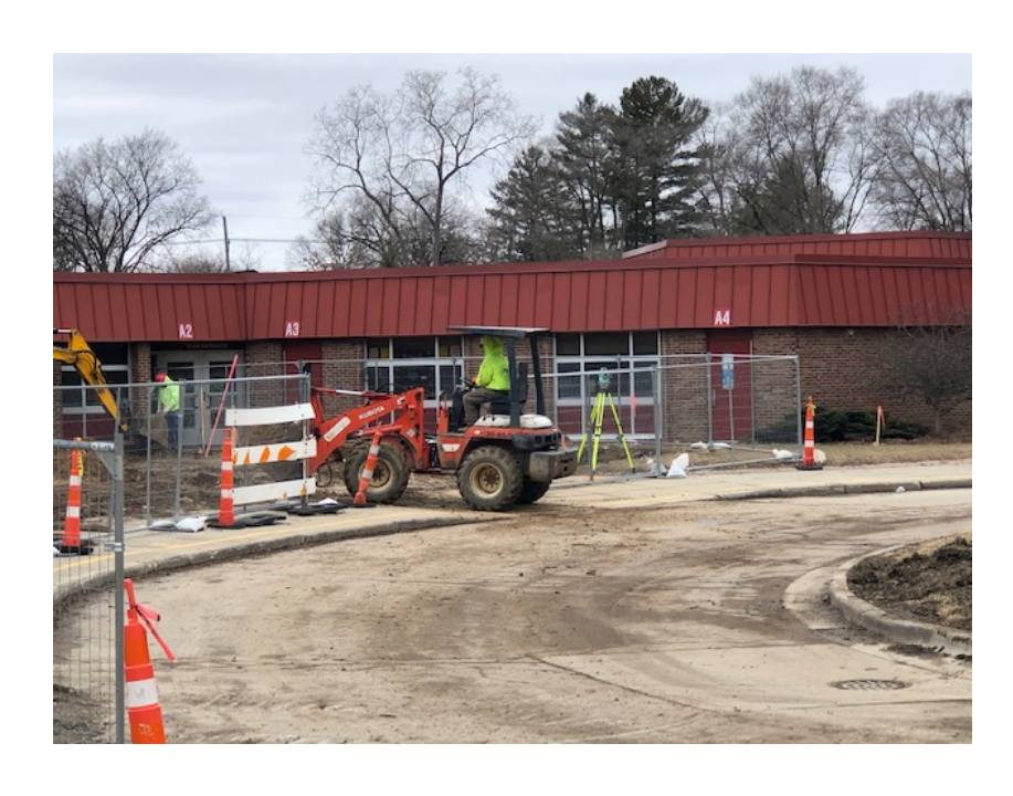
Secured Entry Addition – Temporary Fencing is in Place and Foundation Work is Underway