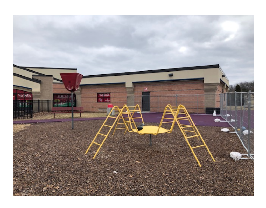
Secured Entry Addition – Temporary Fencing is in Place Around a Portion of Playground. Bench and Ball Hoop to be Removed and Salvaged for Relocation