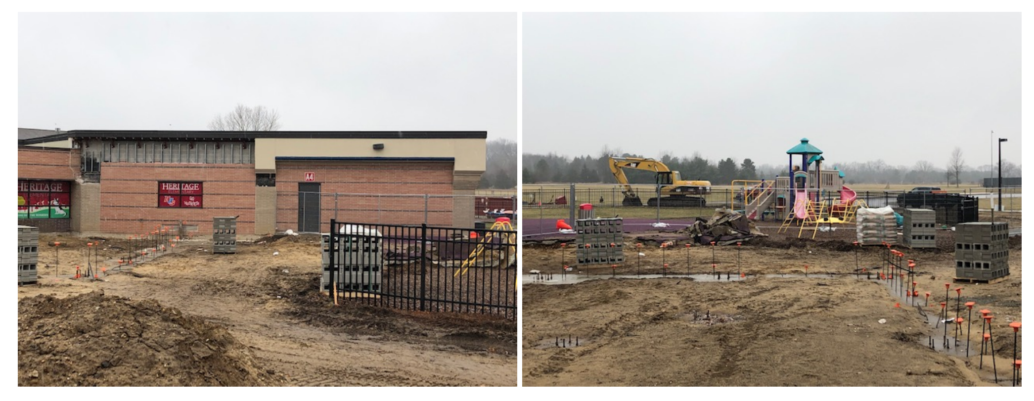
Foundations are complete for secured entrance addition