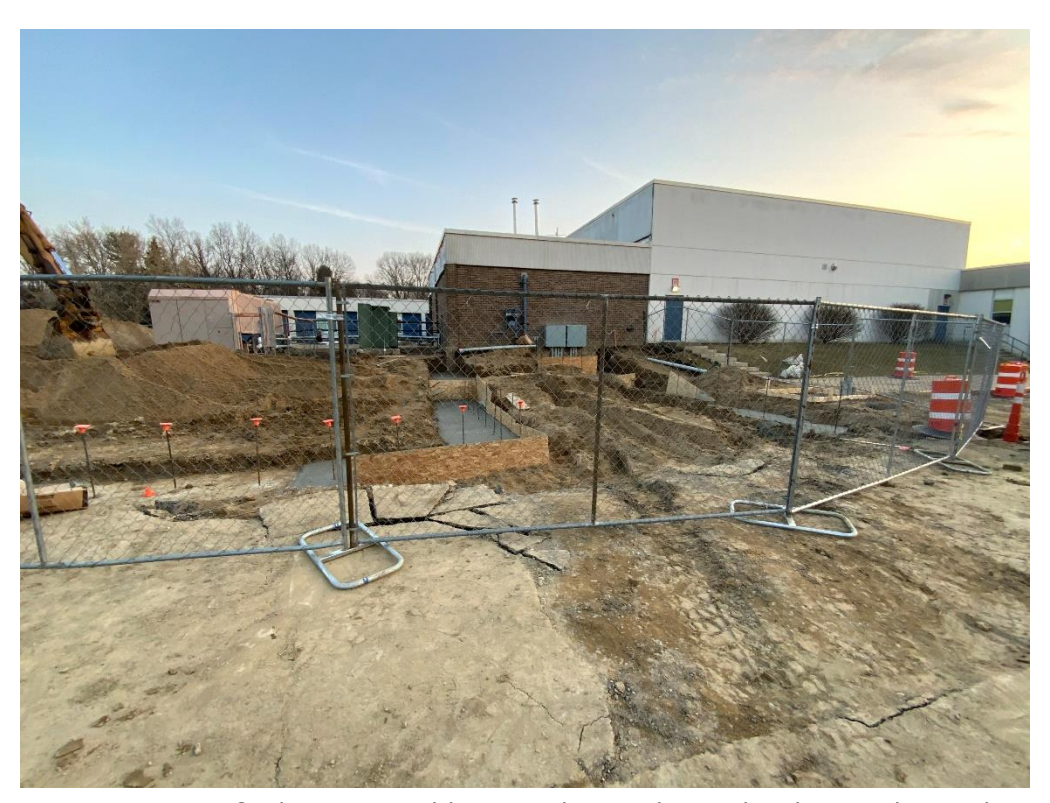
Gymnasium & Classroom Addition – Electrical main has been relocated and foundations have been poured.