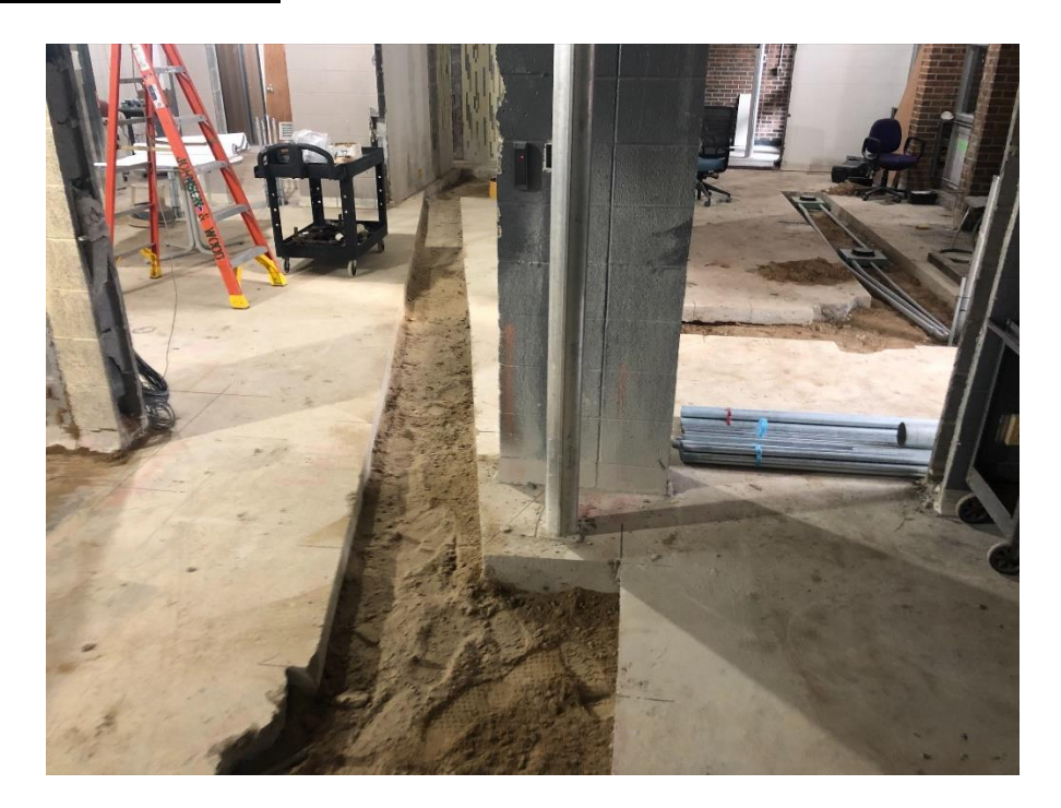
Existing Office – Foundations being prepped to support new interior masonry walls in the office area.