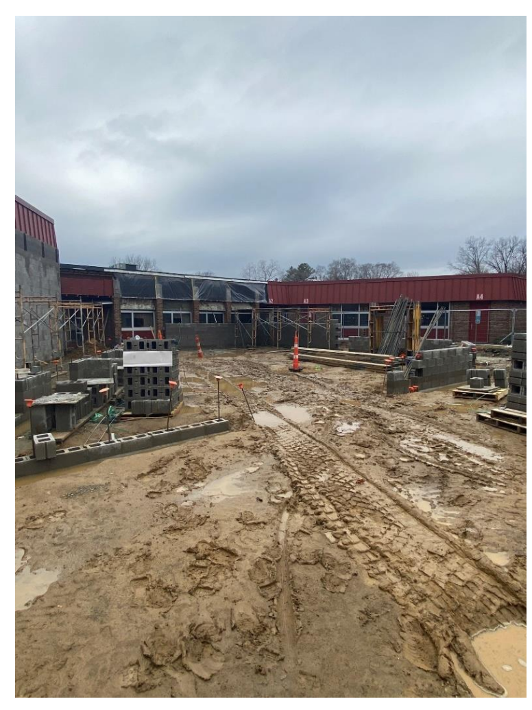
Secured Entry Addition – Masonry walls are ongoing.