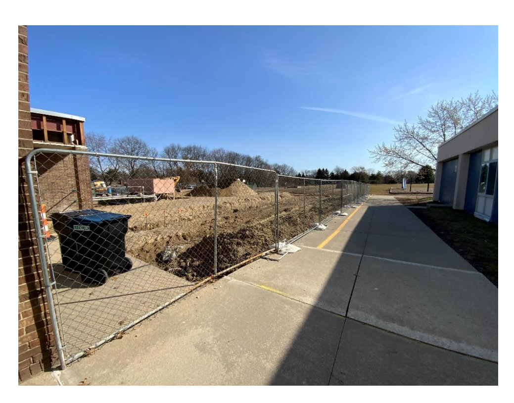
Gymnasium & Classroom Addition – Temporary Fencing to Secure Material and Equipment Staging Area is in Place and Sand Material Has Been Delivered