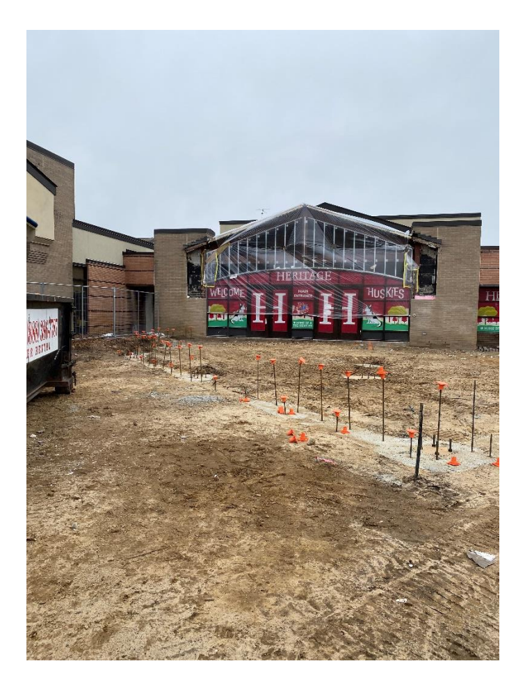
Secured Entry Addition – Foundations are poured, existing exterior removed.