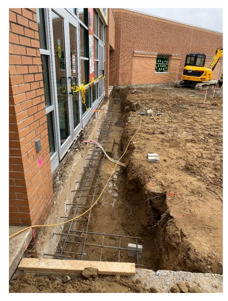
Secured Entry Addition – Excavation for addition foundations is ongoing, foundations will be poured over the new few days.