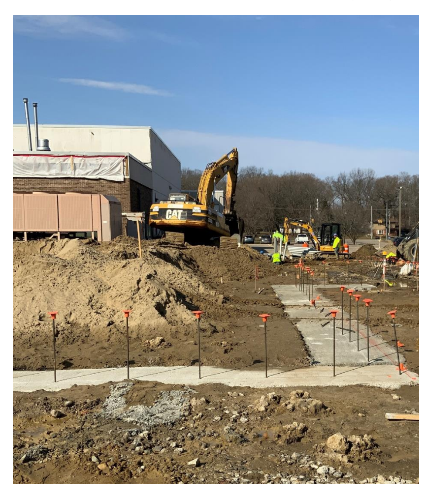
Gymnasium & Classroom Addition – Foundations have been poured and ready for masonry walls.