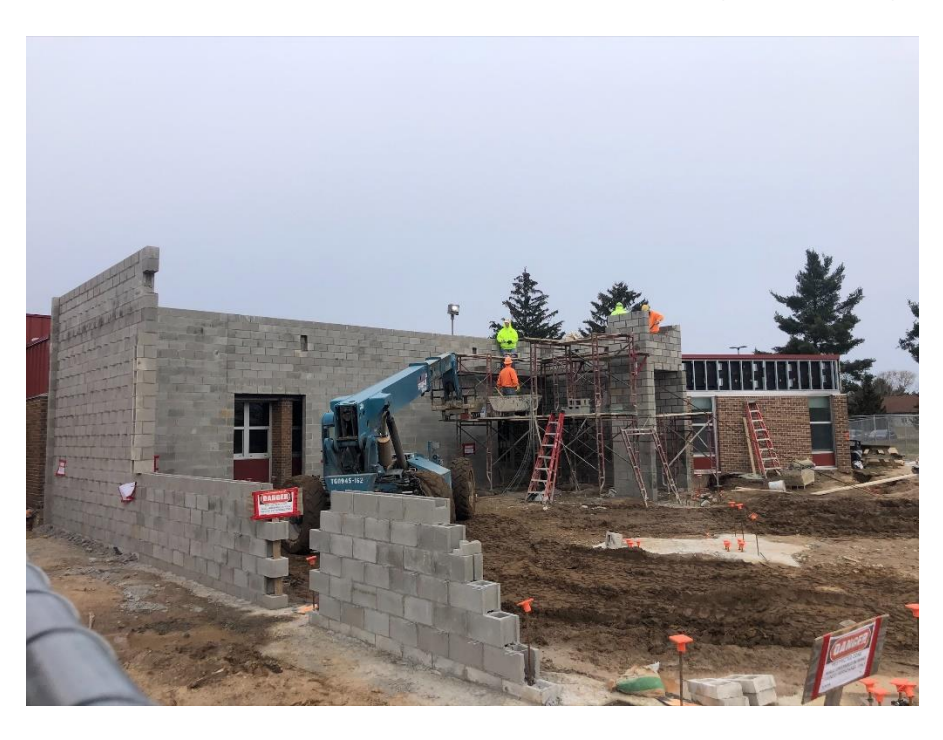
Secured Entry Addition – Masonry walls are underway.