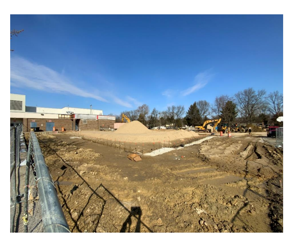
Gymnasium & Classroom Addition – Building Pad After Site Clearing