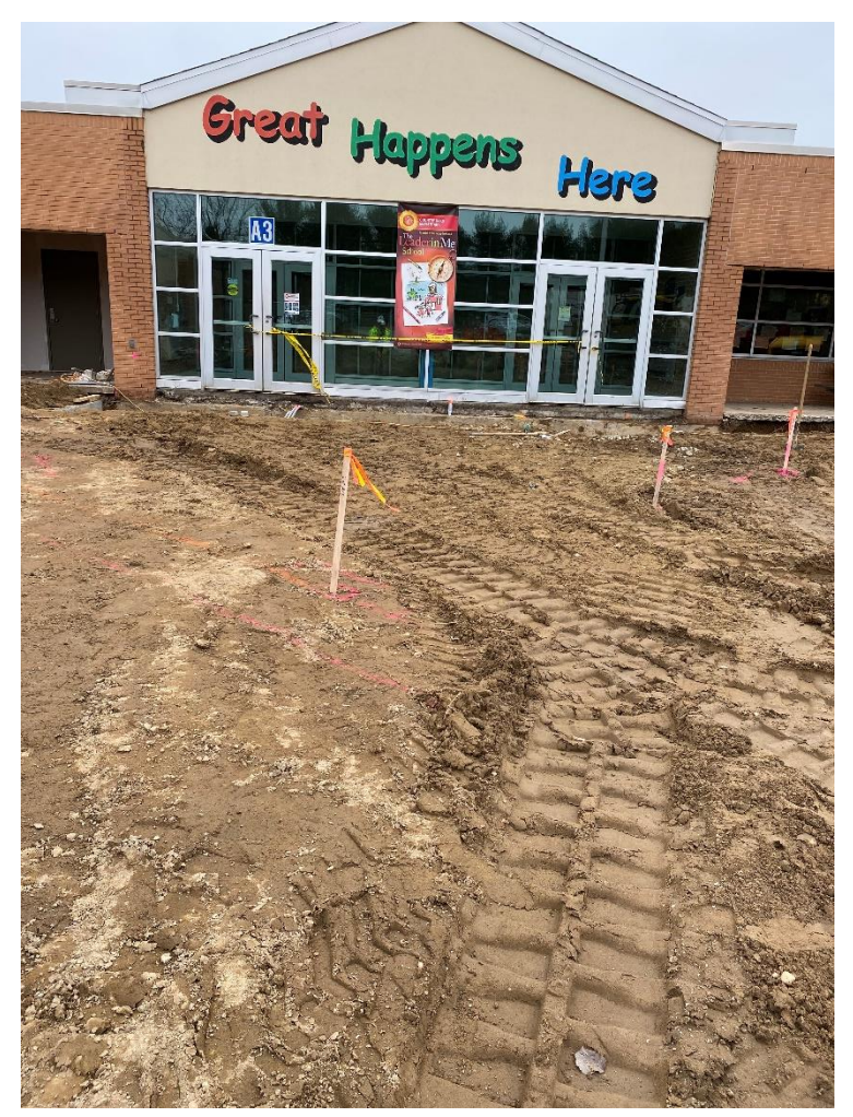
Secured Entry Addition – Site demolition is complete, foundations are staked.