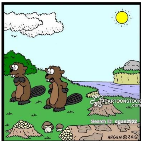
Would you believe they burn the wood they cut down?

The 8th grade class of 2019 will be raffling off a cord of firewood to raise money for the 8th grade trip. The raffle will occur at the Halloween Carnival on October 26. You can purchase tickets from the Butteville front office and from 8th grade students: $5 for one, $20 for five.