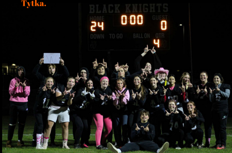
SENIOR POWDERPUFF TEAM