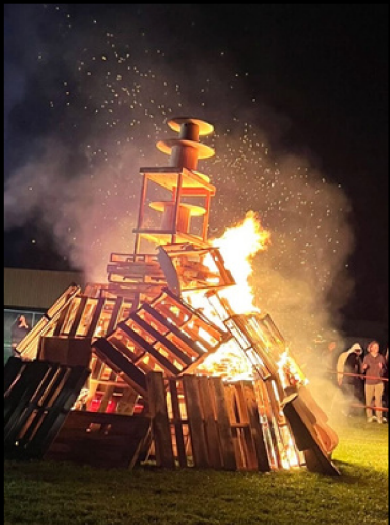
BONFIRE BY EVA TYTKA