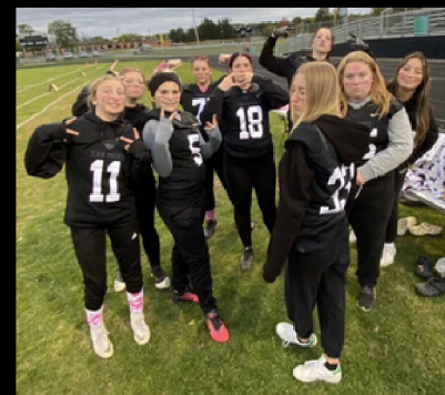
SENIOR POWDER PUFF PLAYERS