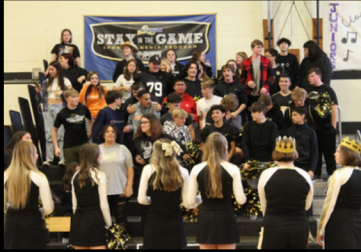
JUNIOR CHEERLEADERS LEADING THE CLASS CHANT