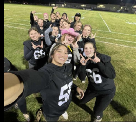
SENIOR POWDER PUFF PLAYERS BY TORY COOK