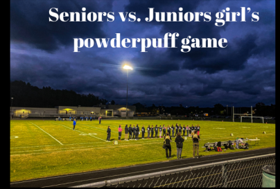
Seniors vs. Juniors girls' powderpuff game