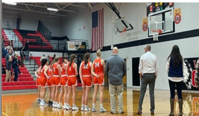
(Varsity Girls lined up for National Anthem)