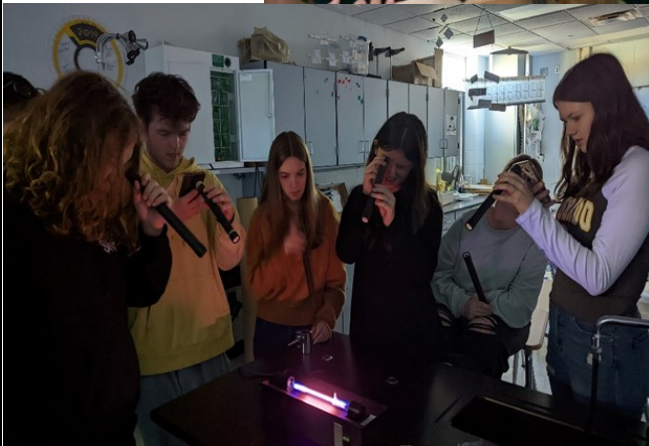
Pictured above: Students in chemistry learning about the field of spectroscopy.