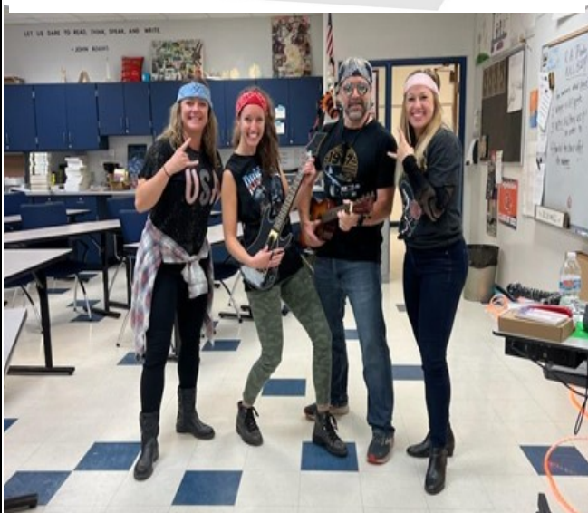
our math department rocks on Halloween (with a guest singer from the English department)