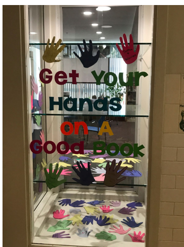
Seen outside of the library