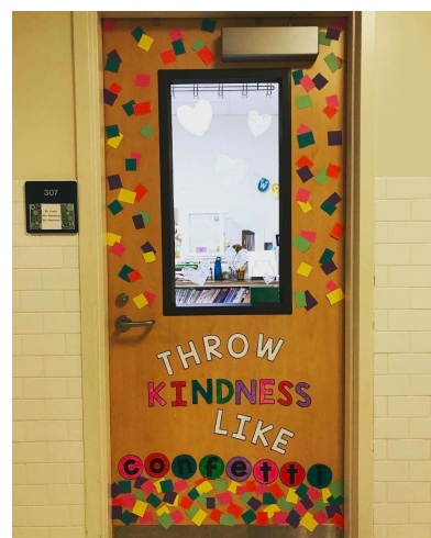
Middle School Resource Room