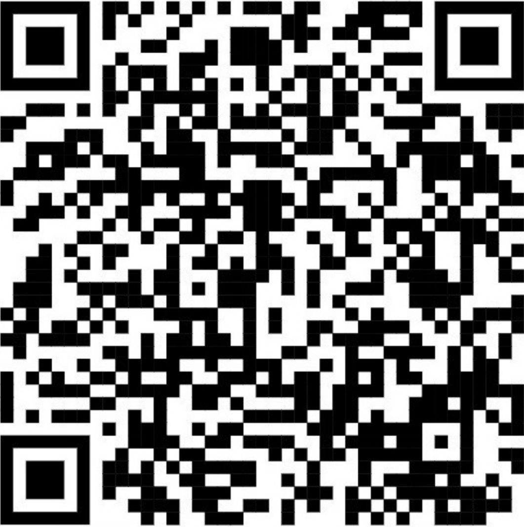
QR Code for Rose Bud State Playoff Games