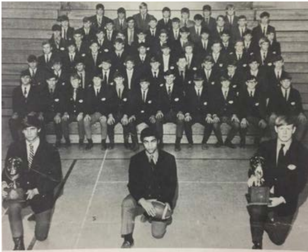
1970 Class A State Football Champions