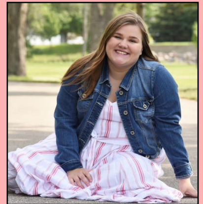
Halle Romaker Lake Area Technical Institute