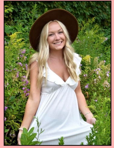
Lily Cruz Lake Area Technical Institute