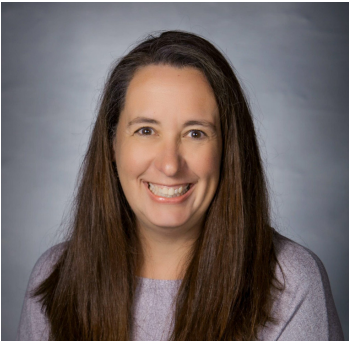
Position: Business Teacher

What are you most looking forward to this school year? I am very excited to meet my new students and learn all about them. I'm also looking forward to working and teaching in the community that I have lived in for 18 years.