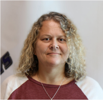
Position: Middle School Special Education Teacher

What are you most looking forward to this school year? I am looking forward to meeting all the new faces and spoiling my kiddos.