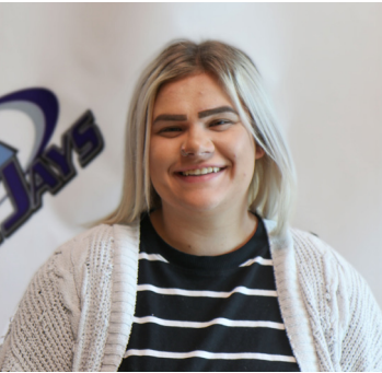
Position: Special Education Teacher at Telegraph and High School Dance Coach

What are you most looking forward to this school year? I am really looking forward to getting to know my students!