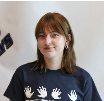
Position: Preschool Teacher

What are you most looking forward to this school year? I am really looking forward to returning to my first love of teaching which is high school students in the area of business.