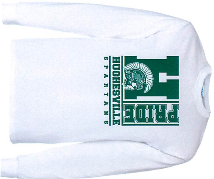
White Long Sleeve Tee