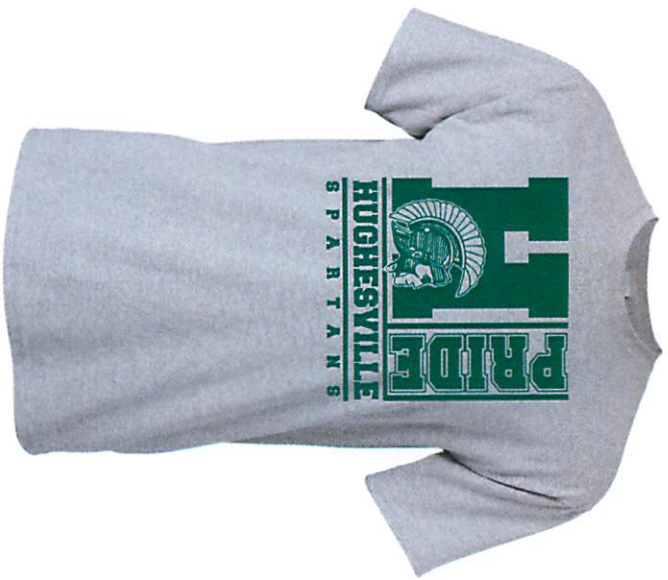
Sport Grey Short Sleeve Tee