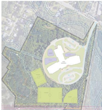
NC 3 – 3A