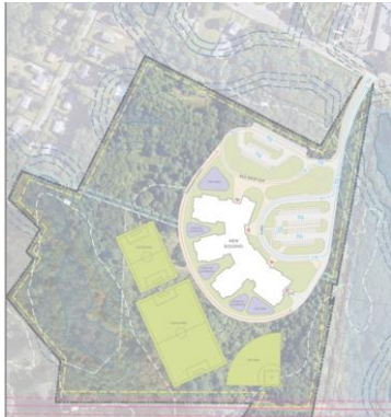
NC 2 – 2A