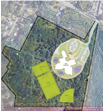
NC 1 – 1A