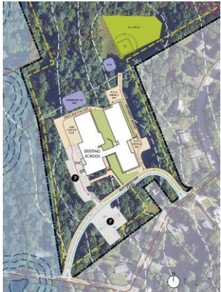
NC 4 – 4A