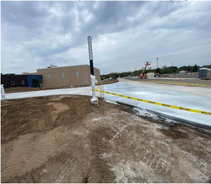
Photo: The bleacher pad concrete foundation installed.