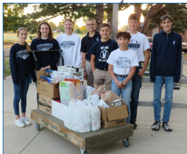
8th grade Student Council members gather the food collected. These students then took the food to the St. Joseph's Food Pantry to stock shelves.

If anyone ever wants to volunteer at the pantry, you can go to Kennedy every first or third Saturday of the month at 9:00 a.m.