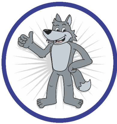
Wolfe City Elementary