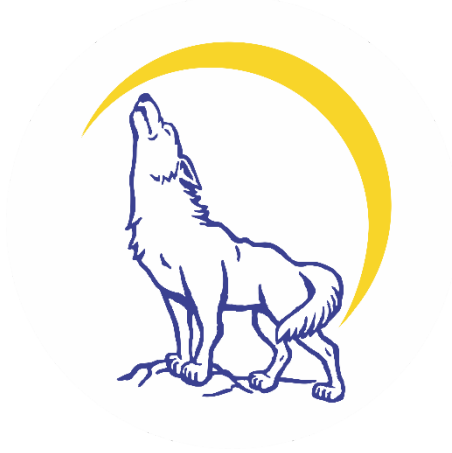
Wolfe City High

Wolfe High to thee we're ever faithful, Wolfe High to thee we're ever true.