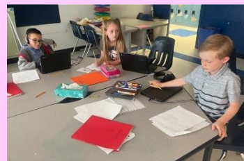
1 st Grade Science